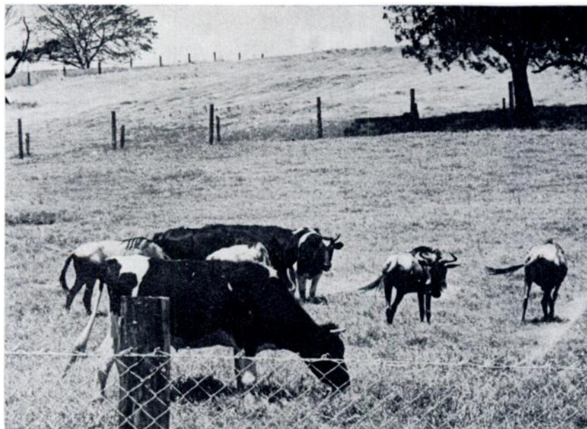
FIGURE 1. Captive wildebeest in close association with cattle.

All but one of the wildebeest nasal swab samples in the first collection yielded negative results. The only isolation of MCFV was made from wildebeest cow W212, from unclarified nasal swab fluid collected on the day of transportation from the quarantine pens to the laboratory paddock. This wildebeest unfortunately died through an adverse reaction to the immobilizing drugs. Nasal swab fluids inoculated onto BTH roller tube monolayers produced typical MCFV CPE by the 10th day p.i. The agent thus isolated was passaged successfully in BTH cultures and at the 6th passage level it was inoculated into two steers in which it caused typical MCF. MCFV was isolated from nasal secretions from one of three wildebeest (W30) captured and introduced into the paddock on 18th July, 1973. This animal was tested for MCFV in blood and nasal secretions 8 times at approximately weekly intervals. MCFV was isolated only from the last sample of nasal secretions taken on 20th September, 1973.