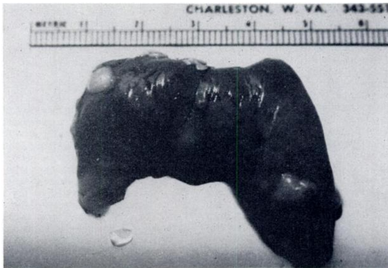
FIGURE 5. Gross appearance of white bass liver with white cysts and dark, sinuous "streaks" characteristic of triaenophoriasis.

Gross and microscopic examination of white bass livers with moderate to heavy infections of T. nodulosus suggest that