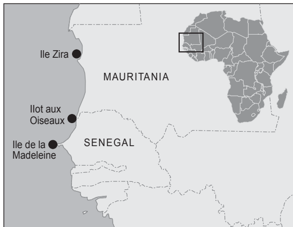
Figure 1. Map of the Atlantic coast of Mauritania and Senegal showing locations (black dots) where pellets of White-breasted Cormorants were collected in the period 2001–2005.

the Senegal River. The foraging area of the cormorants of this roosting site is unknown. The most likely feeding grounds are the nearby ocean, in brackish and fresh water in the river and in freshwater bodies (river, flood plains, lakes and marshes) situated upstream along the river. (3) On 28 November 2001, 49 pellets were collected in a breeding colony with active nests on a rocky island of the National Park ‘Iles de la Madeleine’ situated 2.5 km west of Dakar, Senegal. The cormorants breeding on Ile de la Madeleine are assumed to find their food exclusively in the surrounding ocean as freshwater bodies providing feeding possibilities hardly exist within the foraging range of the species.