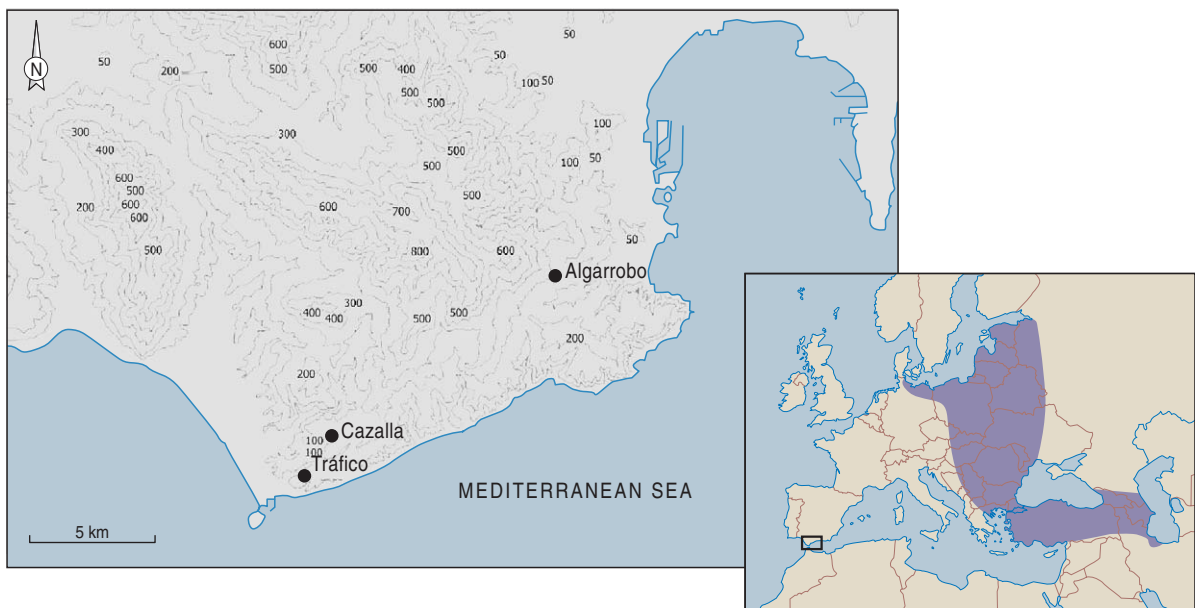
Figure 1. Breeding range of Lesser Spotted Eagle (modified from Riede 2004), study area and observatories used in the monitoring program. Altitudinal lines (m) are indicated.

From 1998 to 2009 a total of 47 LSEs were observed, with annual sightings (Fig. 2). The birds were observed between 6 August and 12 October, with an average and modal date of passage of 16 and 12 September respectively (Fig. 3). The peak of migration occurred between 5 and 24 September (55% of all records). Most of the birds ( n = 35 ) were observed in the central area of the Strait of Gibraltar (Cazalla and Tráfico observatories, Fig. 1), where the largest survey effort was conducted. The birds passed between 7:00 and 16:00 h (UTC), the