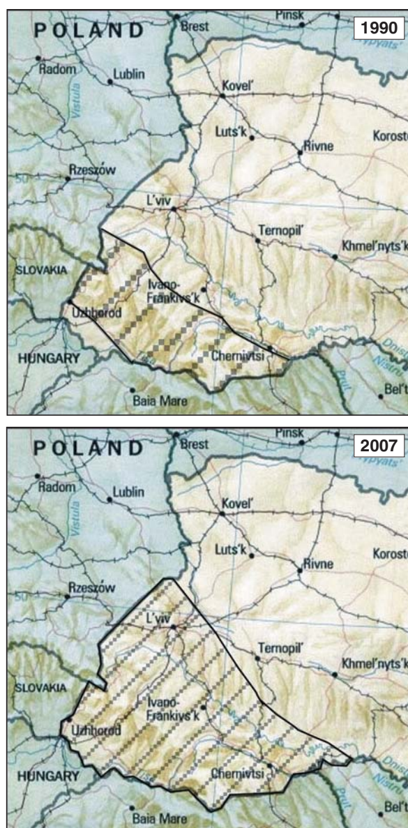
Figure 2. Distribution of the Ural Owl in western Ukraine, as of 1990 and 2007.

In Ukraine, Ural Owls occurred only in the Carpathians area until the last decade. The subspecies S. u. macroura has increased its range southwards and westwards in Slovakia and Hungary (Mebs & Scherzinger 2000, Danko et al. 2002, Adamec et al. 2003, Kristin et al. 2007). The placement of nest boxes has influenced the process of range expansion in eastern Slovakia (Danko et al. 2002). Reintroduction programs at German and Czech sites have been able to re-establish apparently stable populations in the Moravian-Silesian Beskids (Schäffer 1993, Scherzinger 1996, Bufka & Kloubec 1999, Vermouzek et al. 2004).