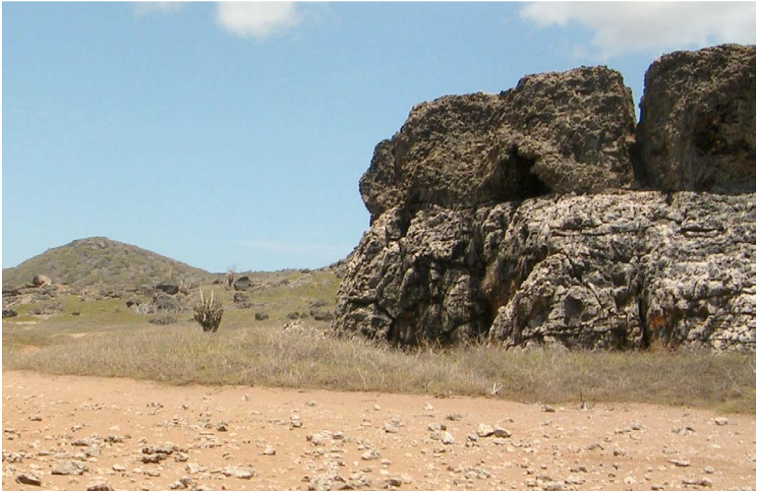
Figure 2. Barn Owl habitat on Bonaire, showing one of the higher limestone terraces near Fontein

of the Middle Terrace on the windward coast of the central part of the island), Roi Sangu (a gorge bordered by high limestone escarpments in the Higher Terrace landscape unit in the southern part of the island), Playa Frans (isolated limestone hill in an undulating landscape unit of volcanic origin) and Fontein (Middle and Higher limestone terraces; Fig. 2). Within the four sites we identified 25 individual roosts (see Table 1 for details). Only fresh pellets (<2 months old) were collected, and later analysed at the Zoological Museum Amsterdam (ZMA). We collected 233 fresh pellets, with a total of 755 identified prey items.