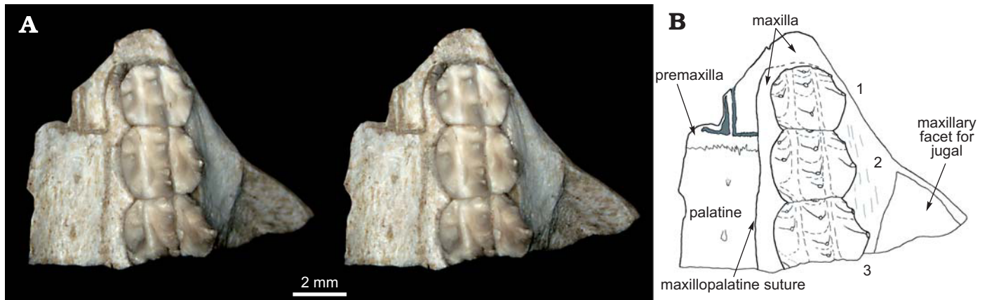
Fig. 1. Tritylodontid cynodont Yuanotherium minor gen. et sp. nov. from the upper part of the Shishugou Formation (Oxfordian, Late Jurassic), Junggar Basin, northwestern Xinjiang, China. IVPP V15335 (holotype), fragment of upper jaw and three anterior postcanines in occlusal view. Stereo pair (A) and explanatory drawing (B). 1–3, the first, second and third left upper postcanines.