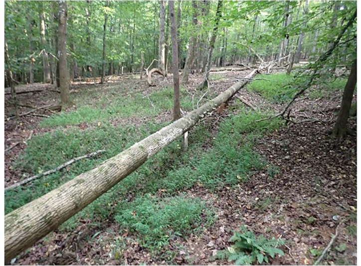
Figure 3. —Japanese stilt grass ( Microstegium vimineum (Trin.) A. Camus.) invasion within the University of Georgia Forest Dynamics Plot (UGA FDP) at the State Botanical Garden of Georgia south of Athens, Georgia, USA (33.9015N, 83.3789W).

prediction of the mesophication hypothesis, that pyrophytic overstory species are being replaced by midstory mesophytic species due to fire suppression. Further research is needed to quantify the abiotic changes associated with mesophication, such as increased soil moisture, decreased temperature, and decreased flammability, to test other predictions of the mesophication hypothesis. Lastly, this research relies heavily on the assumption that stems in smaller size classes are representative of the future overstory, which is commonplace in forestry thinking. Although we believe this is a reasonable assumption, long-term forest dynamics studies are needed to confirm this assumption.