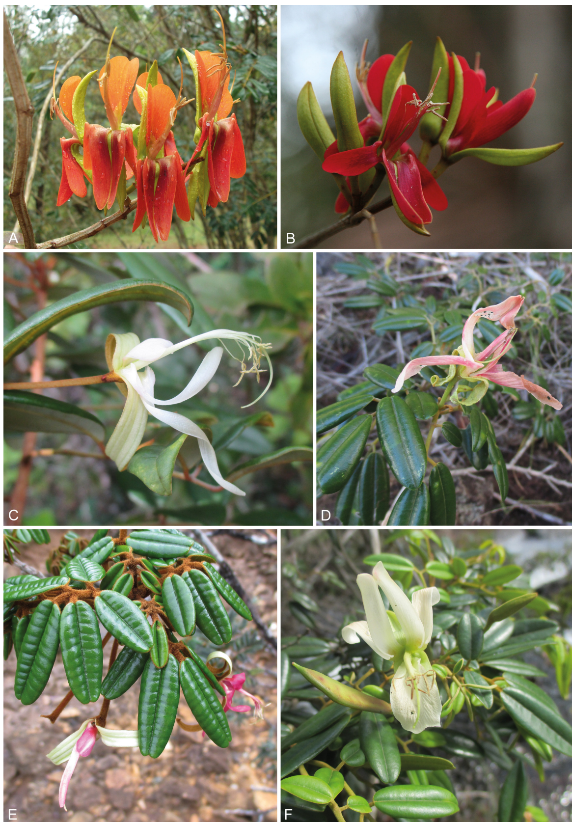
Fig. 1. Flowers of some Cuban species of Harpalyce. – A: H. macrocarpa, cultivated in the Botanical Garden of Villa Clara, Feb 2014; B: H. suberosa, cultivated in the National Botanical Garden of Cuba in La Habana, Feb–Mar 2012; C: H. ekmanii, Prov. Holguín, Moa, Cayoguan, Nov 2020; D: H. acunae (old flower), Prov. Holguín, Mayarí, Sierra de Nipe, Jan 2020; E: H. villosa, Prov. Holguín, Moa, El Toldo, Apr 2015; F: H. nipensis, Prov. Holguín, Sierra de Nipe, Aug 2020.