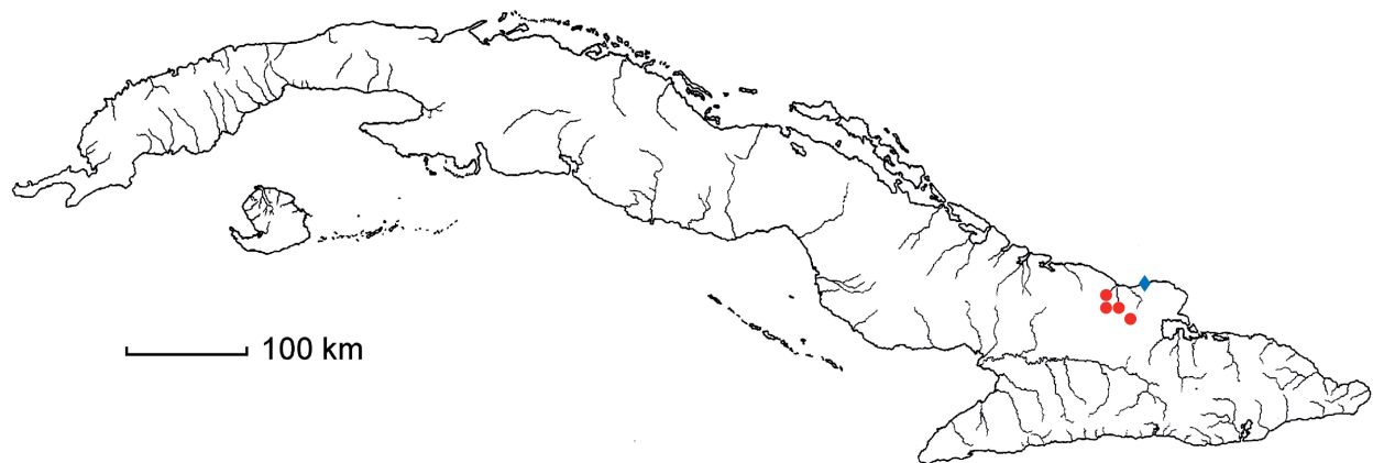
Fig. 4. Distribution of Harpalyce greuteri . The red dots indicate the localities where the species was previously collected but not relocated during our field work. The blue diamond indicates Bahía Naranjo, the type locality where the species has been relocated.

The distribution area of the species is very fragmented, and apparently very reduced from its former extent. The area of occupancy (AOO) in Bahía de Naranjo, where approximately 50 individuals occur, is less than 2 km 2 . At the localities El Paraíso and San Marcos the species probably no longer exists. We estimate that in the other two well-preserved localities Las Margaritas and El Mocho there could be a similar number of plants as at Bahía de Naranjo, and we predict that the total number of surviving individuals of Harpalyce greuteri is approximately 150 and that the AOO in these two other well-preserved localities is each less than 2 km 2 . Applying IUCN conservation assessment criteria (IUCN 2017), H. greuteri can be considered Endangered (EN) under the criteria B1ab(i,ii,iii,iv,v)+2ab(i,ii,iii,iv,v). The existence of H. greuteri together with other narrowly restricted Cuban endemics, mentioned above, on this small patch of serpentine outcrop, deserves urgent conservation attention.