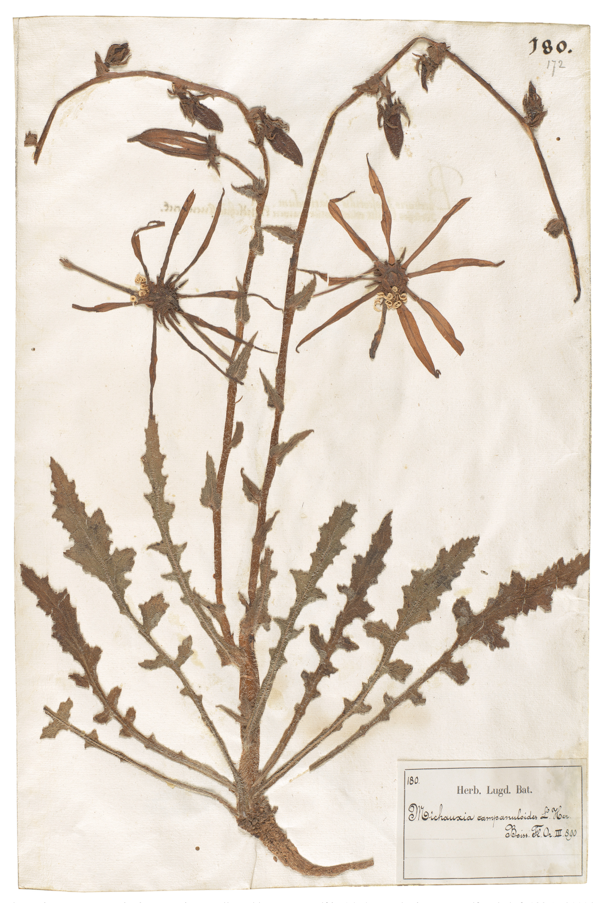
Fig. 2. Michauxia campanuloides – specimen collected by L. Rauwolf in 1575. – Herbarium Rauwolf, vol. 4, f. 180 (L.2111470). – Leiden, Naturalis Biodiversity Center.