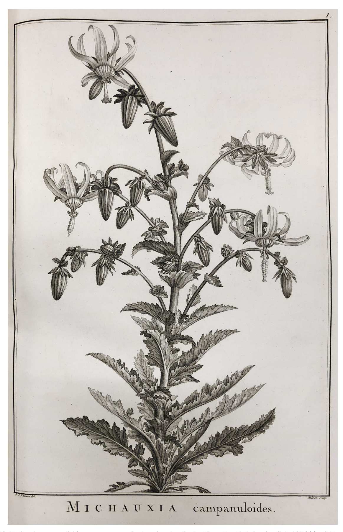
Fig. 3. Michauxia campanuloides – copper engraving based on drawing by Pierre-Joseph Redouté. – C.-L. L'Héritier de Brutelle, Michauxia: t. 1. 1788, [Paris]. – Wien, Universität Wien, Universitätsbibliothek.