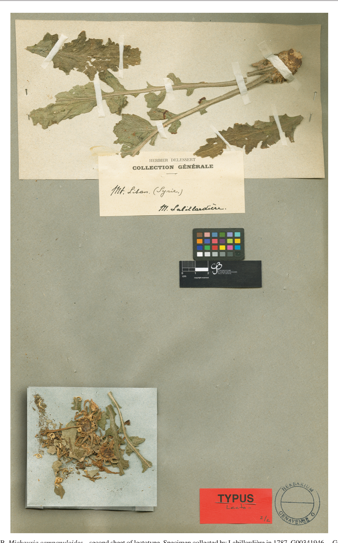
Fig. 4B. Michauxia campanuloides – second sheet of lectotype. Specimen collected by Labillardière in 1787, G00341946. – Geneva, Conservatoire et Jardin botaniques, Herbarium.