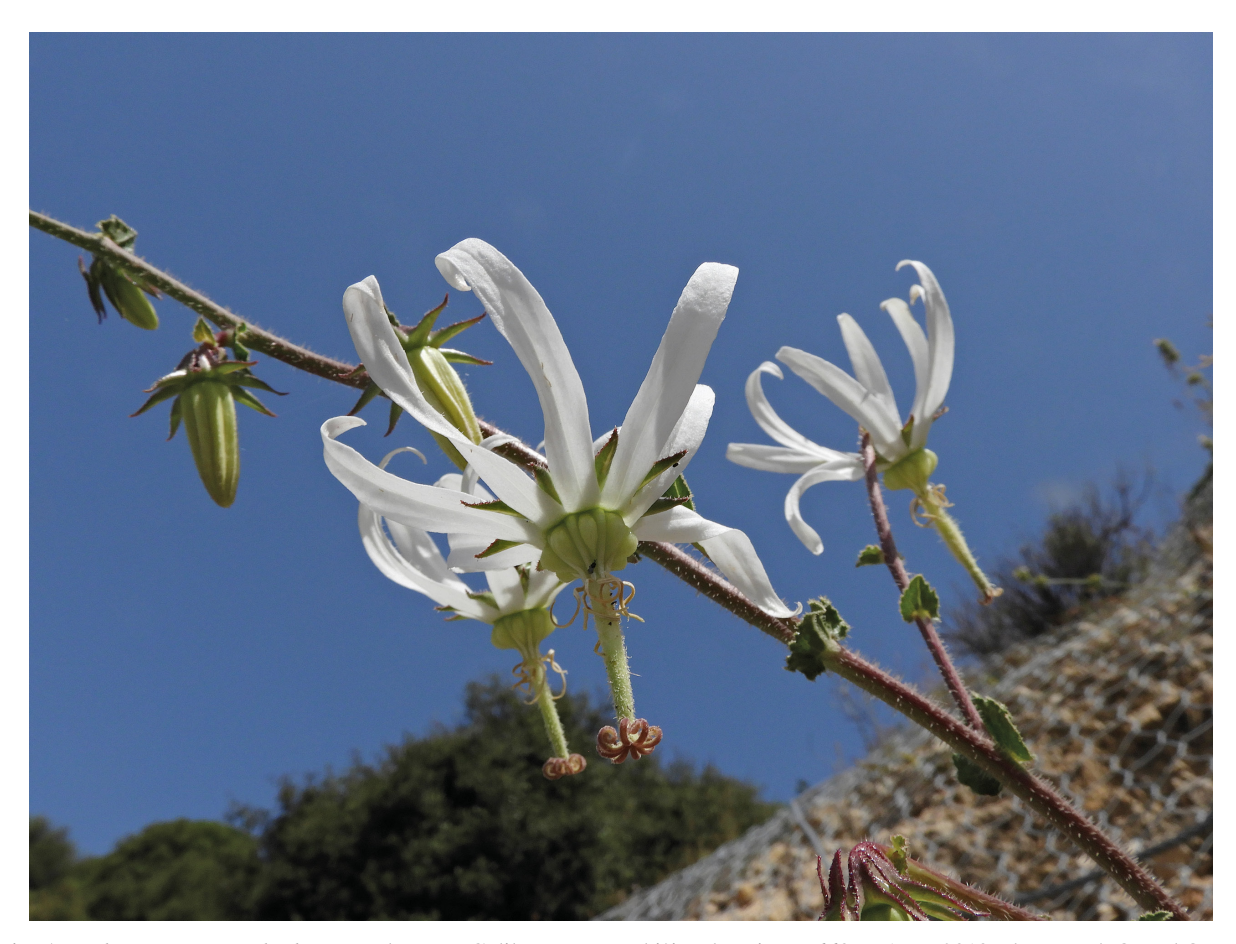
Fig. 5. Michauxia campanuloides – Israel, Upper Galilee, Mount Peki'in, elevation c. 660 m, 1 Jun 2019.

Aiton's Hortus kewensis in 1789 as currently given in IPNI (https://www.ipni.org/).