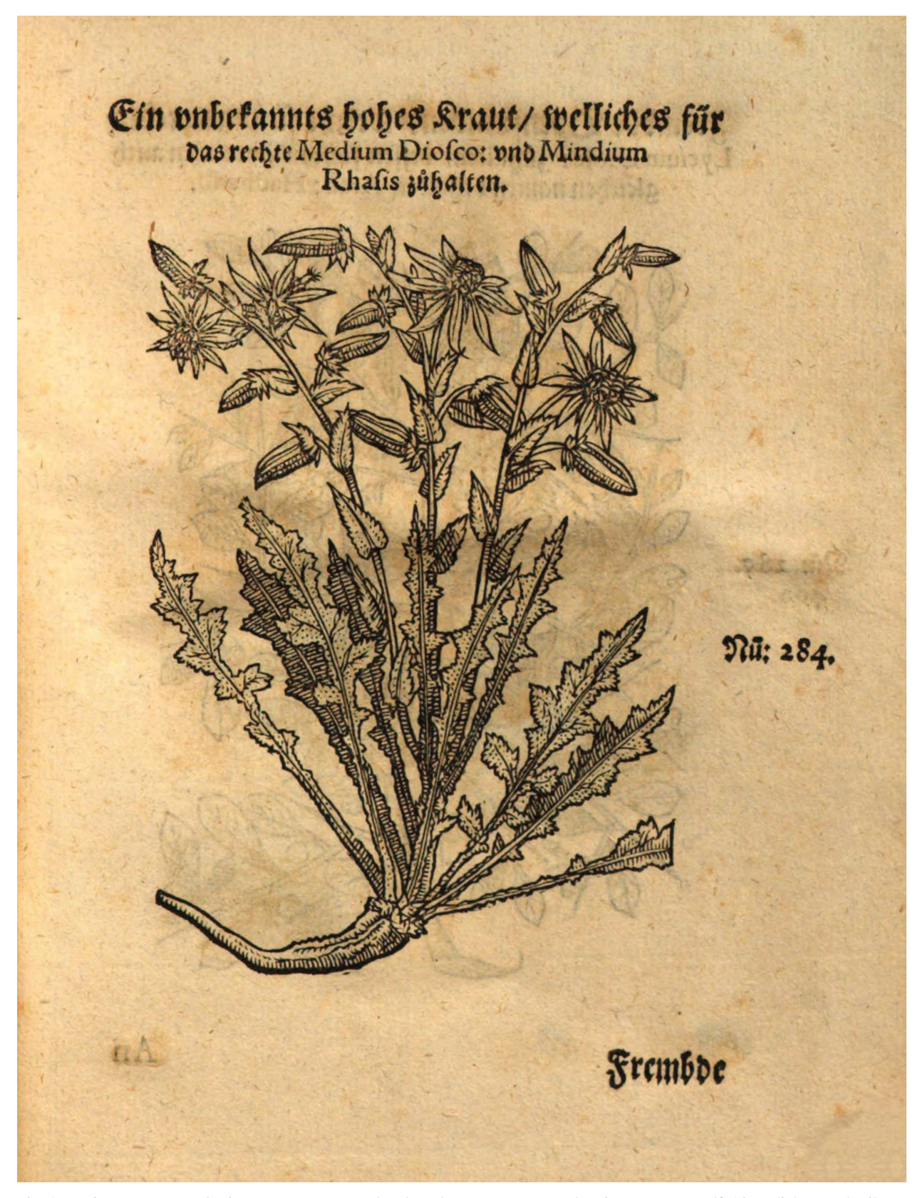
Fig. 1. Michauxia campanuloides – anonymous woodcut based on an anonymous drawing. – L. Rauwolf, Aigentliche Beschreibung der Reiß inn die Morgenländer: t. [35]. 1583, Laugingen: L. Reinmichel. – München, Bayerische Staatsbibliothek.

Gronovius (1696–1762), a classical philologist, and Johannes Burman (1707–1779) (Rutger 2008). However, there is no indication that he ever studied the Rauwolf