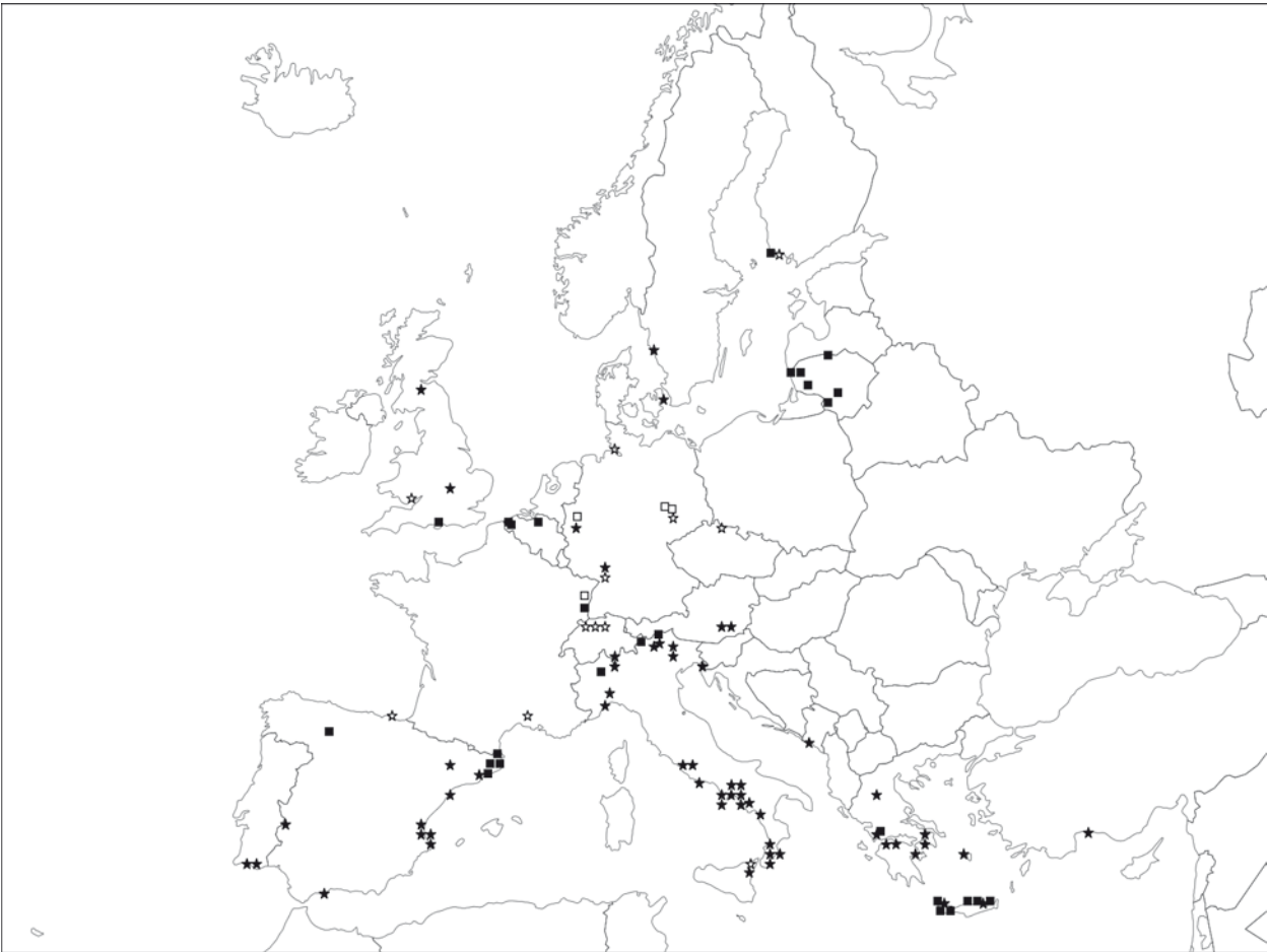
Fig. 2. Digitaria ciliaris in Europe. – Revised herbarium vouchers (empty stars: collected before 1950, filled stars: after 1950) and records drawn from the literature (empty squares: before 1950, filled squares: after 1950). In the event that literature records and herbarium vouchers coincide, only the latter are presented on the map. Symbols may stand for more than one record if sites are too close to be indicated separately. The Atlantic islands (Macaronesia) with their respective records are not shown. See the text for details.

MONTENEGRO: Tivat, Lastra, st. betonski zid iznad mora, 15.9.1996, Karamari (?) 1005 (BEOU). SWEDEN: SÖDERMANLANDS LÄN: Nyköping, Perioden, inford med bomull, 9.1915, Carl Blom (W). SWITZERLAND: TICINO: Sessa (Malcantone) Scree, Sasso Biotta, felsige Stellen in Waldlichtung, 18.8.1991, E. Landolt (ZT). – ZUG: Lorenzital östlich von Baar, Unkraut in Maisfeld, 4.9.1983, K. U. Kramer (Z). – ZÜRICH: Schlieren, Schlatt, Waldschlag, 12.10.1990, E. Landolt (ZT); Stallikon, Maisfelder S Baldern, 31.8.1991, E. Landolt (ZT); Fluntern, Zürichberg, hinter dem Chlösterli, Maisacker, 14.9.1992, E. Landolt (ZT); Uitikon, Maisacker N Kantonalen Erziehungsanstalt, 24.9.1994, E. Landolt (ZT).