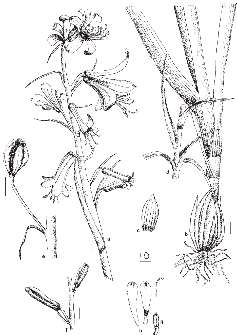
Fig. 1. Notholirion koeiei Rech.f. – a: inflorescence; b: habit; c: coat of the tunica; d: portion of the leafy stem; e: capsule; f: flower buds; g: pistil; h: tepal, dorsal (1) and ventral (2) side; i: seed. – Scale = 1 cm; drawing after plants of the population from near Aqrah.