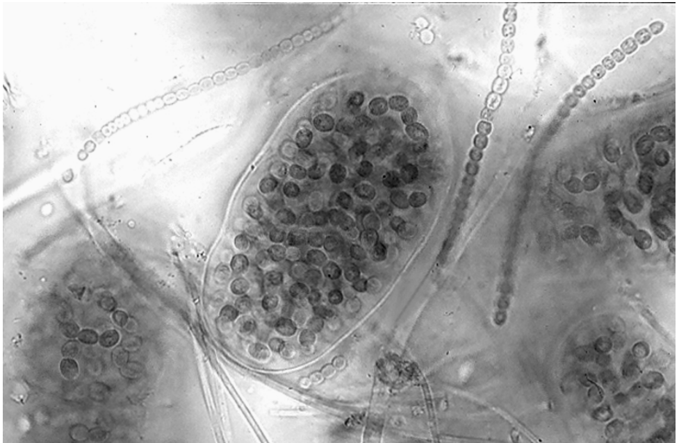
Fig. 4. Gallert-enclosed trichomes of Nostoc sp. (cyanobacteria) characteristic of the algal flora of the sandy surface of sampling site Tillabéri, collecting date 13.9.1994.

Scytonema sp.: Wide (10 µm) blue-green trichomes, cells cylindrical, only slightly longer than wide, end of trichome obtusely rounded. Cell content appearing granular. Red-brown mucilaginous sheath partly visible enveloping older trichomes. Flatly cylindrical heterocysts, hormogones and false branching visible in older cultures.