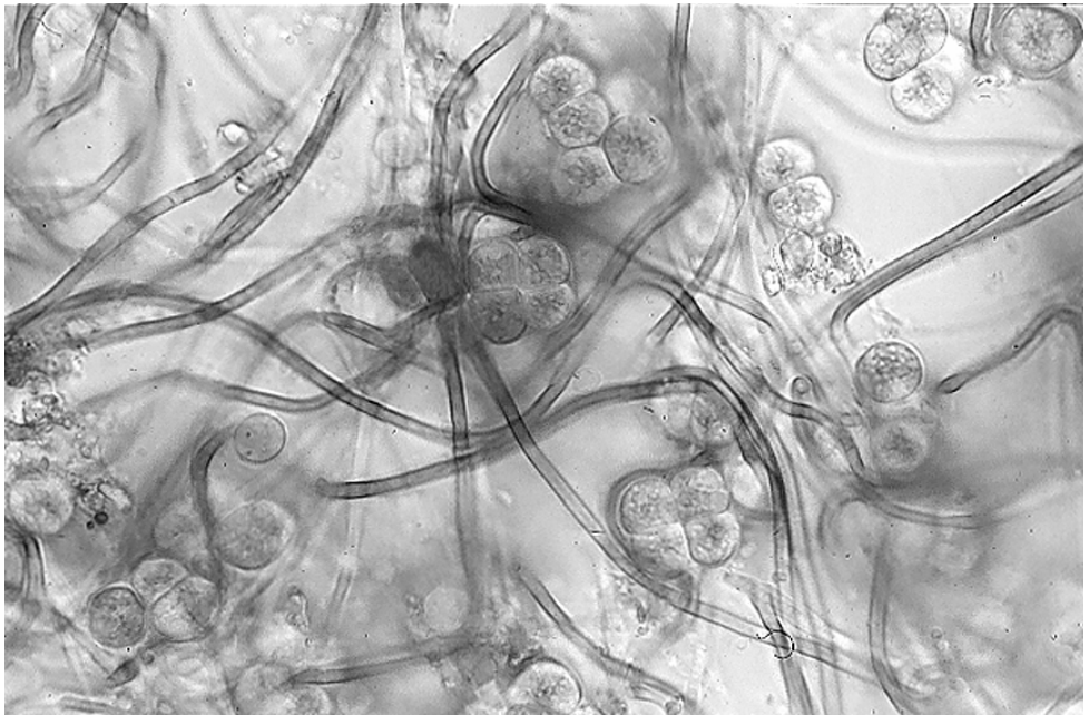
Fig. 5. Filamentous blue-green algae (cyanobacteria) and coccal green forms ( Tribophyceae or Chlorophyceae ) from site T3, collecting date 17.8.1993.

detectable algae in the dry season samples of 1995 from Bandio to very few algae in low diversities in the dry season sample of 1994 from Bandio, Burkina and both samples from Tahoua. Only the light soil crusts from Tillabéri were more diverse in their algal composition with one to four filamentous blue-green and three to six coccal green forms. Representatives of the blue-greens Schizothrix , Scytonema and Aphanizomenon , dominating the dark crusts of sites T2 and T3, were not present in the Tillabéri samples, where only one Nostoc species was detected.