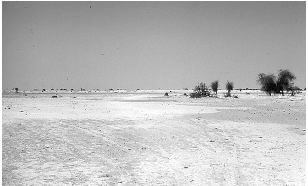
Fig. 2. Highly degraded area with sealed surfaces, S of Bandio (10.3.1995).

2.2.1994 and 10.3.1995. The coordinates are 13°48'43"N, 01°03'46"E and 13°48'35"N, 01°03'48"E. The predominant pale soil could be discriminated in paler and darker sections. The area is seasonally flooded. The mean annual rainfall (rain gauge Gotheye) is 377 mm for the period 1981-95. An example for dark crusts is given in Fig. 3.