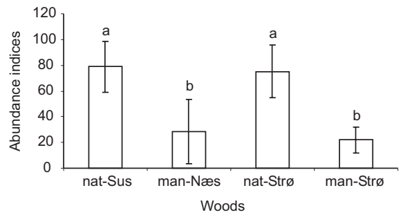
Fig. 1. Abundance index (all species/day) in the four forests. Identical letters indicate no significant difference between indices based on pairwise Turkey-Kramer Tests at p > 0.05 significance level. Sig-nificant differences at p < 0.001

It was assumed that the number of foraging observations serves as a good measurement of bird abundance in the forests (Table 1). Based on this assumption an abundance index was calculated as the average number of 1 st obs./day. The number of foraging observations was generally much higher in the natural old-growth forests than in the intensively managed ones. Daily mean number of observations in nat-woods were 76.9 ± 22.3 compared with 24.9 ± 16.3 in man-woods. The abundance indices in the forests for all species pooled was found to be significantly different (Repeated measures ANOVA based on