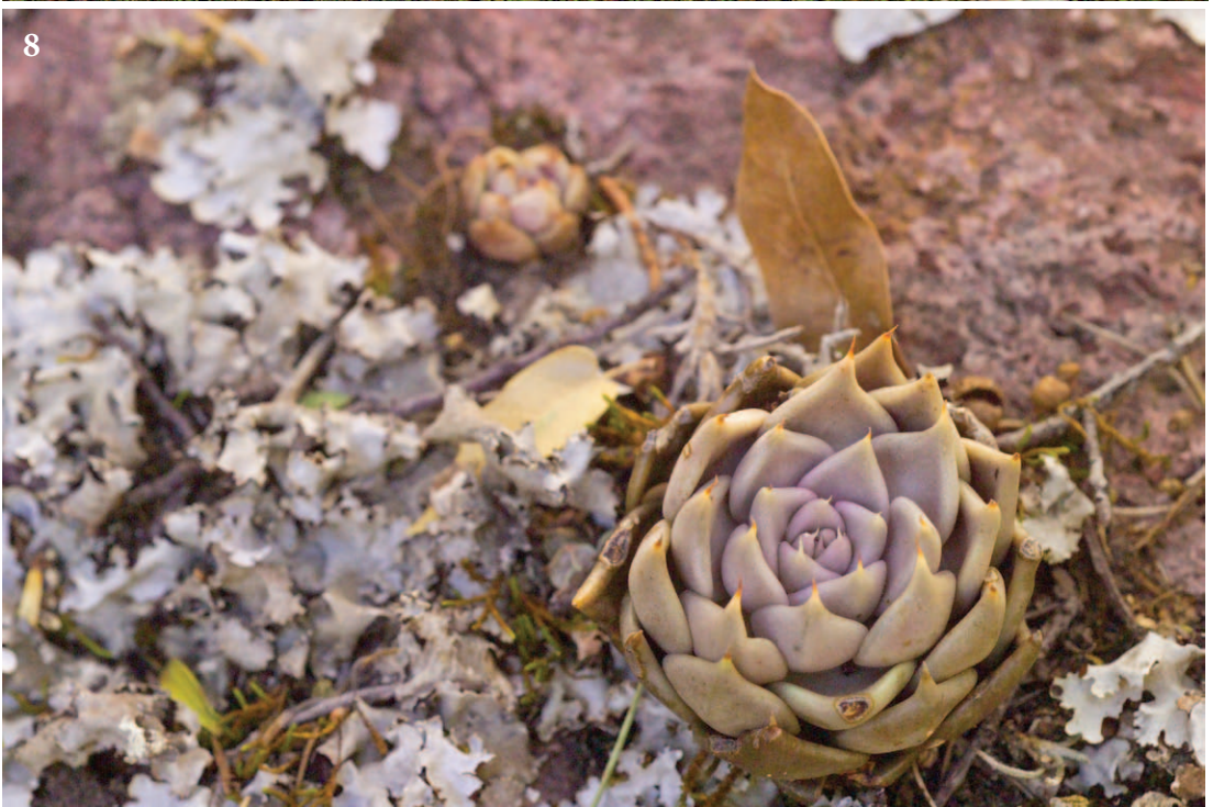
7 A beautiful adult specimen of Echeveria tobarensis growing on top of a mossy rock. 8 The similar colors of rock, lichen and plant make it difficult to spot the rosettes of Echeveria tobarensis .

genera consisting of only a few species and the three were moved back into the genus Echeveria as E. agavoides , E. purpurorum and E. tobarensis . The genus Echeveria is currently divided into 17 series (Walther, 1972; Kimnach, 2003).