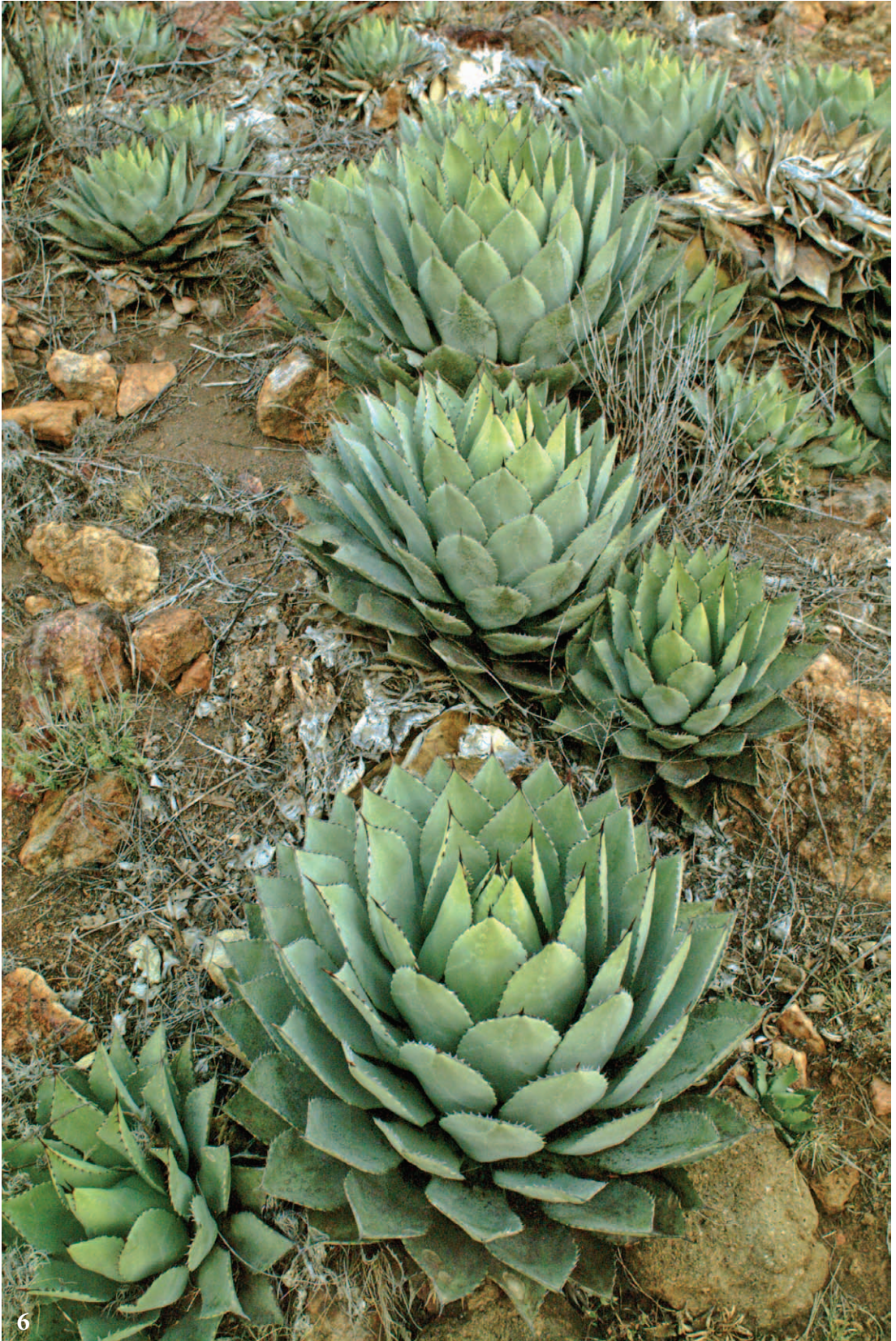
6 Typical Agave parryi ssp. parryi populating the mountain slopes behind the old mining town.