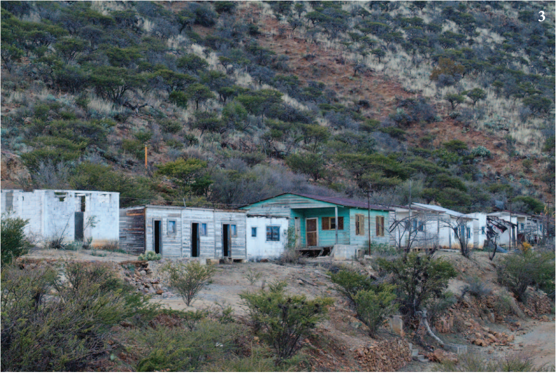
3 Abandoned houses in the old mining town of Tovar (2001).