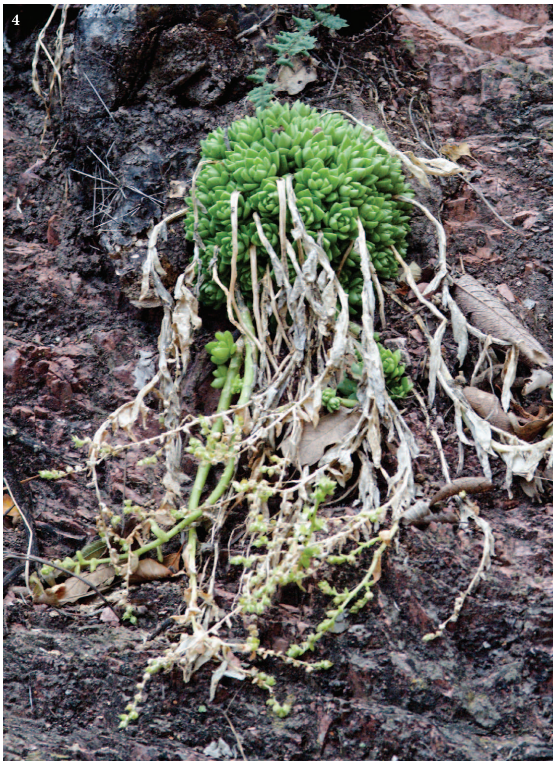
4 A cluster of Sedum glabrum with dried inflorescences growing on the shady canyon walls.

abandoned mine site some nine miles along the dirt road from Tepehuanes to Topia. Several hours' search in the deep canyon revealed only Echeveria paniculata . In 1976 I again visited the locality,