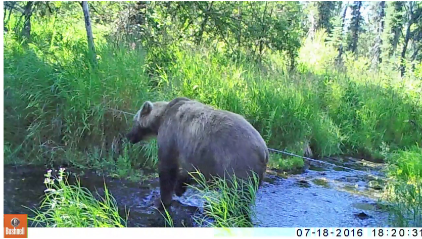
Figure 1. Still image from a video (Supplementary material Video A1) showing a brown bear that apparently inspected and then walked away from a wire deployed to obtain hair samples on Hansen Creek, Alaska.

It was not always possible to determine sex due to the lighting, camera angle and bear position, but of the 350 approaches, 28 female and 90 male bears were identified. Females avoided the wire more often than did males (39.3% of interactions versus 20.0%; Table 1; \chi^2=4.29 , 1 df, p=0.038 ). There were 274 videos containing adult bears (including those in which sex could not be determined) and 65 videos containing yearling and spring cubs. Adult bears avoided the wire in 21.2% of the approaches, whereas cubs avoided the wire in 12.3% of them (Table 1; \chi^2=2.63 , 1 df, p=0.10 ). The videos showed 298 individual bears, and 52 in groups from 2 to 4 bears. Individual bears avoided the wire 20.5% of the time, whereas bears in groups avoided the wire in 11.5% of interactions (Table 1; \chi^2=2.28 , 1 df, p=0.13 ). The bears were least often detected in the day (Fig. 3). Of the 350 approaches analyzed, 23.7% were during daylight, 17.1% at dusk, 44.9% at night and 14.3% at dawn, indicating a very low approach rate in the day. Bears avoided the wire in 10.8% of the approaches in the day, 19.1% during crepuscular periods combined (16.0% at dawn and 21.7% at dusk) and 23.6% at night (Table 1; \chi^2=7.32 , 2 df, p=0.026 ).