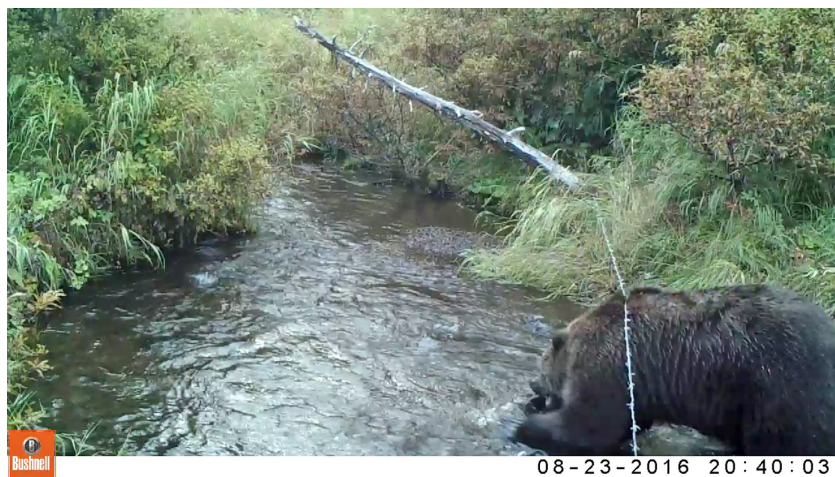
Figure 2. Still image from a video (Supplementary material Video A2) showing a brown bear that contacted a wire deployed to obtain hair samples while it was catching a sockeye salmon in Eagle Creek, Alaska.

Female bears avoided the wires more often than did males. This finding was unexpected because females often seem to be more tolerant of human-disturbed areas than males, and may even use human activity as a shield against male infanticide (Rode et al. 2006, Steyaert et al. 2016). Most females identified in videos were accompanied by cubs, which could make them warier of potential dangers while foraging in streams. For example, elk Cervus canadensis in Yellowstone National Park spent more time being vigilant