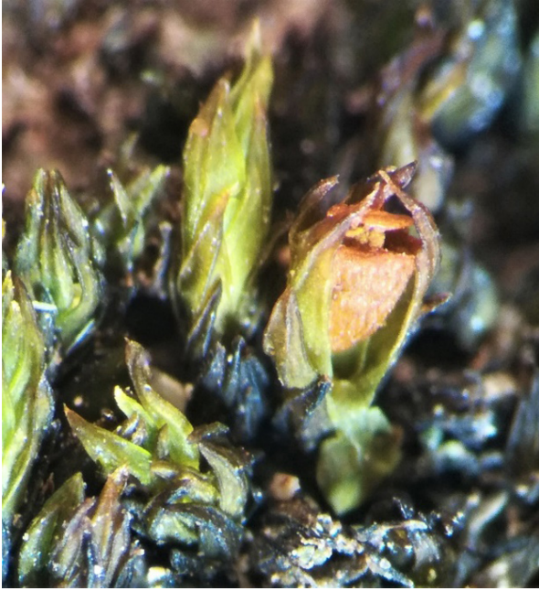
Figure 3. Plant of Schistidium succulentum from the French Alps with the perichaetial leaves that are typically inclining above the capsules (from T. Kiebacher 2975).