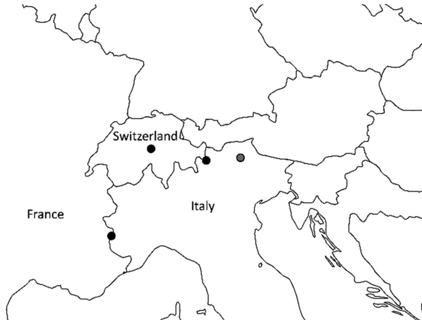
Figure 5. Known distribution of Schistidium succulentum in Europe. Previous record (grey circle; Kiebacher 2020) and records presented here (black circles). The record from the border region between Italy and Switzerland was previously referred to S. subconfertum .

Anabar (Ignatova et al. 2010) are due to phenotypic plasticity, presumably in response to habitat conditions. This has support from the ITS sequences that are identical in specimens from Italy and Caucasus (Kiebacher 2020). However, a certain (genetic) differentiation caused by the isolation of the alpine population of the species cannot be excluded.