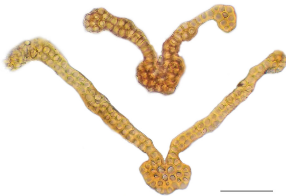
Figure 2. Leaf cross sections of Schistidium succulentum from the Glowacki-specimen (GJO 0102803). Scale: 50 \mu\text{m} .

However, it can easily be distinguished from S. succulentum by the short capsules (up to 1.3 \times as long as wide) and the very short rostrum formed as a mamilla. In contrast, S. succulentum has elongate capsules (1.5–1.7 \times ) and a distinctly rostrate lid. Another Schistidium -species with a reduced peristome is S. cryptocarpum Mogensen & H.H. Blom, known from arctic parts of Asia and North America. It differs from S. succulentum in the 1 (–2) stratose leaf margins (versus 2–4 stratose) and the campanulate (versus cylindrical) capsules.