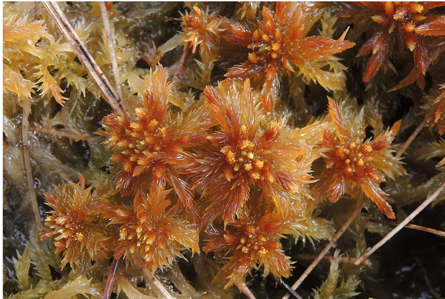
Figure 5. Sphagnum annulatum in Tuulijoki mires, Kittilä.

We had lunch close to a meso-eutrophic spring in Lehmäkaltionvuoma. The species we found in the spring and its creek were Poblia wahlenbergii , Bryum weigeli , Warnstorfia exannulata and Philonotis seriata . We also found patches of Sphagnum teres near the spring.