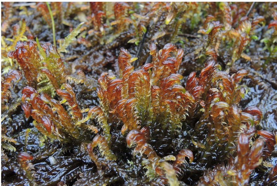
Figure 3. Hamatocaulis lapponicus in Viiankiaapa, Sodankylä.