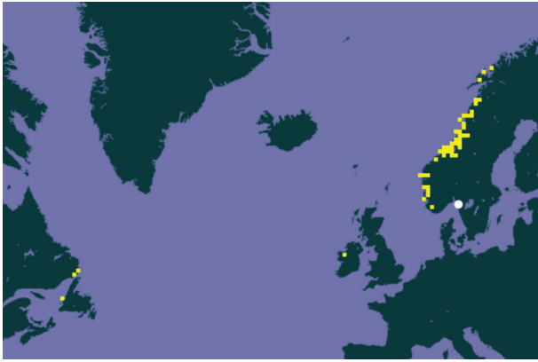
Figure 1. Distribution map of Sphagnum beothuk (yellow squares) from GBIF (GBIF Secretariat: GBIF Backbone Taxonomy. doi:10.15468/39omei, accessed via <www.gbif.org/species/7846758> on 2017-03-30) with the new record in Sweden marked (white circle). The species certainly occurs more abundantly in Britain and Ireland than shown on the map, but the exact frequency and distribution of S. beothuk in relation to S. fuscum in this area is under revision.