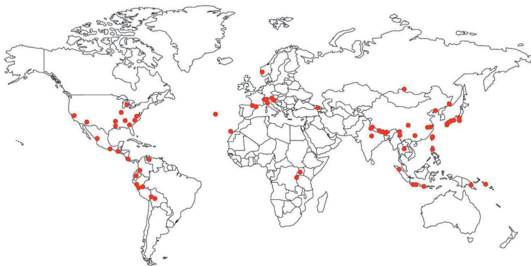
Figure 10. World distribution of Scopelophila ligulata .

Copper mosses have traditionally been considered to be more or less restricted to substrates with high concentrations of copper and/or other heavy metals. The substrates of several species have been analysed (Mårtensson and Berggren 1954, Shacklette 1967, Shaw and Anderson 1988), but the results are inconsistent and the relationships between plants and substrates have not been fully resolved. It has been proposed that the acidity of the substrate, rather than the metal ion content, is the abiotic factor that favours the occurrence of copper mosses (Hegi 1927, Persson 1948). A low pH is indeed common for the majority of analysed substrates, presumably caused by oxidation of reduced sulphur to sulphuric acid. Schatz (1955) suggested that sulphur might be the determinant factor for the occurrence of copper mosses, and that it would