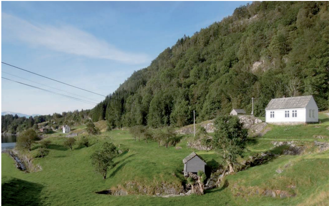
Figure 1. The steep slope with deciduous forest in which Scopelophila ligulata was first found.