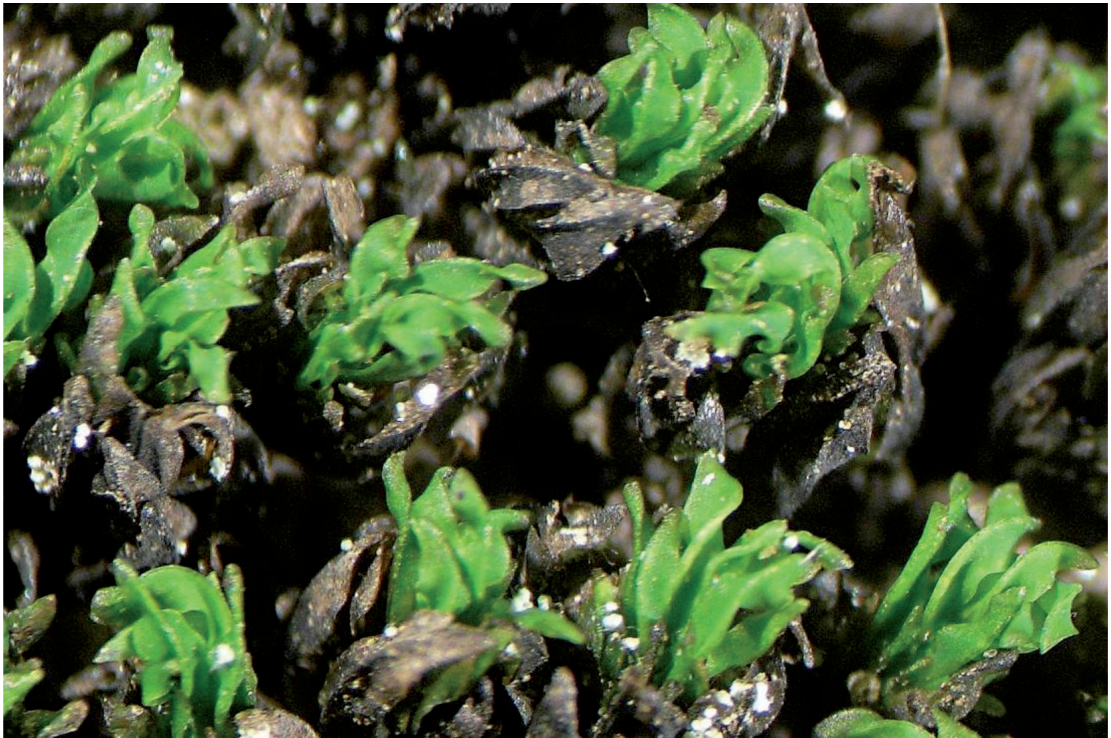
Figure 2. Dry plants of Scopelophila ligulata .