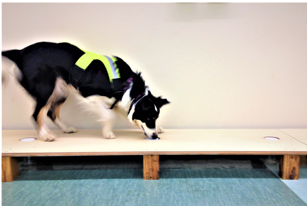
Fig. 2. Platform indicating how containers with breathable lids were placed below the surface and how the platform was used by the detection dog for operant conditioning and during tests.

A raised platform (used as a training aid) with evenly spaced, 6 cm diameter holes was used to create a “false bottom”. The platform allowed 10 spaces for positive- and negative targets to be concealed in containers below the work surface