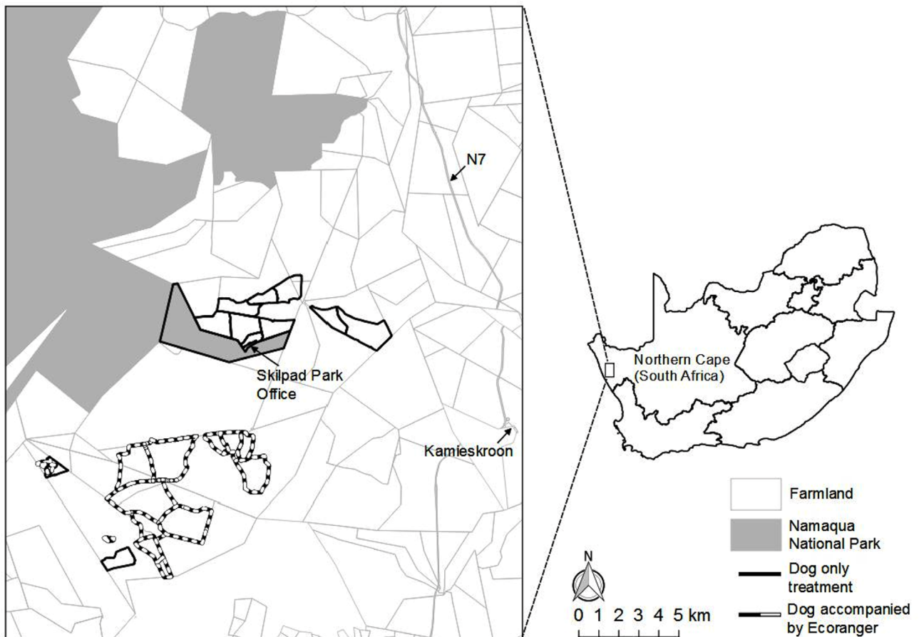
Fig. 1. Map of the study area in the Northern Cape Province of South Africa. The boundaries of different farm sections on commercial small-livestock farms are represented by grey lines. Camps with dogs only are delineated by black lines and camps with dogs accompanied by Ecorangers are delineated by black and white lines. The Namaqua National Park is in grey shading, with the Skilpad section of the park used periodically by a sheep flock.

cluster visitation, to investigate whether LGDs consume wildlife, including native species, as well as livestock. We separated our results according to two treatments: LGDs accompanied by a human attendant (Ecoranger), and LGDs guarding livestock on their own. Based on our review of the literature, we predicted that 1) LGD diets would include some wildlife and domestic species, and 2) that LGDs guarding on their own would consume more wildlife and livestock than those accompanied by an Ecoranger. Our study provides insight into the relationship between LGDs, Ecorangers and the wild and domestic species that share the landscape. The information documented herein contributes to a growing understanding of the secondary effects of methods traditionally classified as nonlethal predator management.