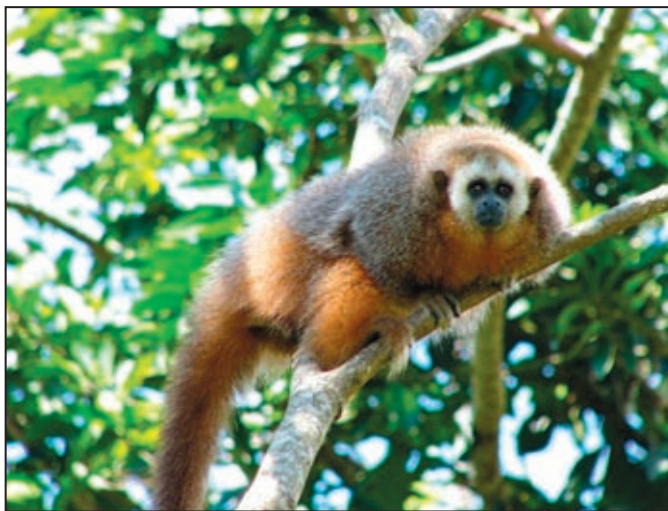
Figure 2. The Río Mayo titi monkey, Callicebus oenanthe . Adult female near Moyobamba (6°01'31.9"S, 76°59'33.7"W, elevation 891 m a.s.l. )