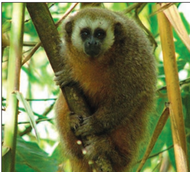
Figure 3. The Río Mayo titi monkey, Callicebus oenanthe . Juvenile near Moyobamba (6°01'31.9"S, 76°59'33.7"W, elevation 891 m a.s.l. ).

I studied a group of five C. oenanthe in a privately-owned fragmented forest, near the town of Moyobamba (6°01'31.9"S, 76°59'33.7"W) at an elevation of 891 m a.s.l. The Alto Mayo valley is in the eastern foothills of the Andes, in the northeastern Department of San Martín, which comprises the provinces of Rioja and Moyobamba. The broad valley is flat to undulating, with low hills, high hills, and mountainous terrains. It is surrounded by the Cordillera Oriental to the southwest and the Cahuapanas to the northeast. The forest surrounding Moyobamba is Humid Premontane Tropical Forest, according to the Holdridge system of life zones (Holdridge 1967). The climate is tropical and humid, with the rainy season occurring from October to April, averaging 148 mm of rainfall per month. The dry season is from June to August, averaging 60 mm/month. The months of transition are May and September, during which average rainfall is 103 mm/month. Most variability in rainfall occurs from October through March (wet season). The average monthly temperature ranges from a minimum of 16°C to 21°C and a maximum of 26°C to 30°C, with an average annual temperature of 22°C (Peru, PEAM 2004).