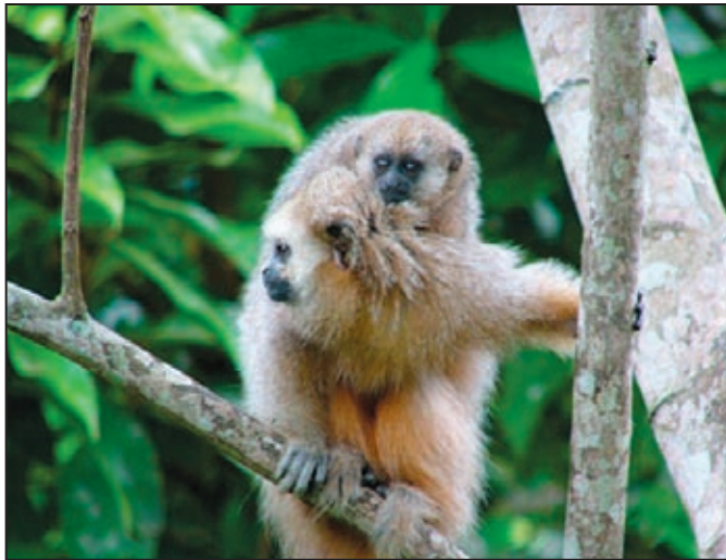
Figure 1. The Río Mayo titi monkey, Callicebus oenanthe . Adult male and infant near Moyobamba (6°01'31.9"S, 76°59'33.7"W, elevation 891 m a.s.l. ).