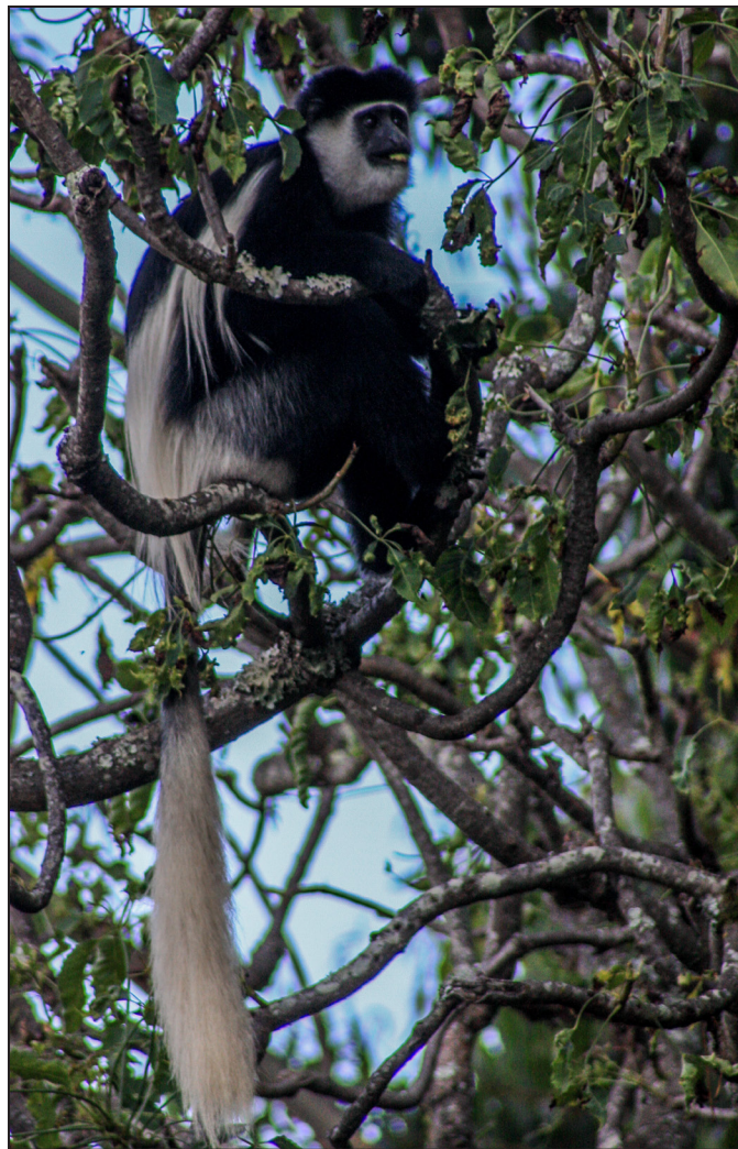
Figure 2. Adult male Mount Kenya guereza Colobus guereza kikuyuensis , Nanyuki, central Kenya. In this subspecies, 71–81% of the tail is white.

Primate surveys were conducted 27–28 September 2014 from a vehicle and on foot by the two authors. Transects were run along dirt roads and foot paths. These were selected to maximize the chances of encountering as many individuals of as many species of primate as possible. As time was very limited, the rapid assessment survey method was used, as described in Butynski and Koster (1994), White and Edwards (2000), and Butynski and De Jong (2012).