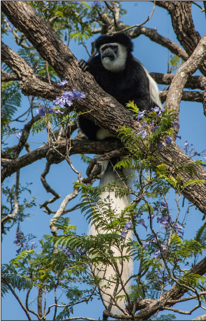
Figure 3. Adult male Mount Kilimanjaro guereza Colobus guereza caudatus , Usa River, northeast Tanzania. In this subspecies, 71–88% of the tail is white and the tail tuft is extremely full.

(Burseraeae). Mean annual rainfall is c. 600 mm and mean annual temperature is c. 23°C (<climate-data.org>).