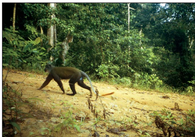
Figure 4. Cercopithecus solatus photo taken using camera trapping, close to Mount Mimongo.

Fifteen camera traps were deployed in a 30-km 2 study area over 54 days between 28 August and 21 October 2004 in an area about 10 km to the south of the southern bank of the Lolo River. No images of C. solatus were obtained. This indicates that the species is either absent or very rare south of the Lolo River. Lauren Coad and local field assistants conducted a hunting study from January 2004 to January 2005 in the same area in two villages, Dibouka (01°19'07"S, 12°12'54"E) and Kouagna (01°18'28"S, 12°13'45"E). Their results showed considerable hunting pressure that was highest within 5 km from the villages, but also extended up to hunting camps 12 km to the north, on the southern bank of the Lolo. During this study all hunting returns for the two villages were recorded, and no C. solatus were ever caught or seen. During a previous hunting study in these villages conducted by Malcolm Starkey from 2000 to 2002, no C. solatus were