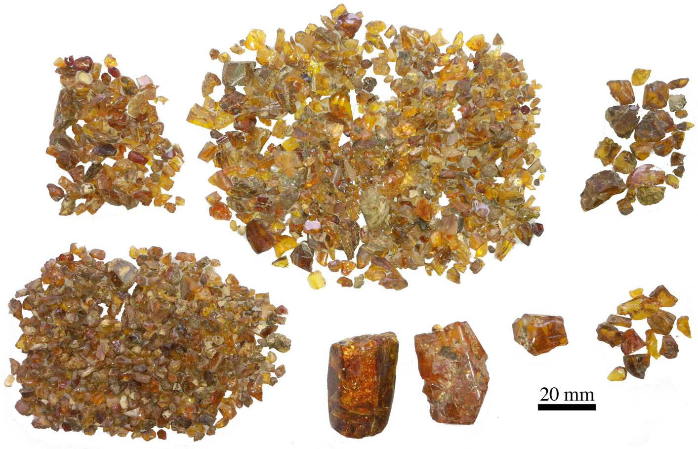
Figure A2. A sample of Vendean amber showing the size and color of various pieces.