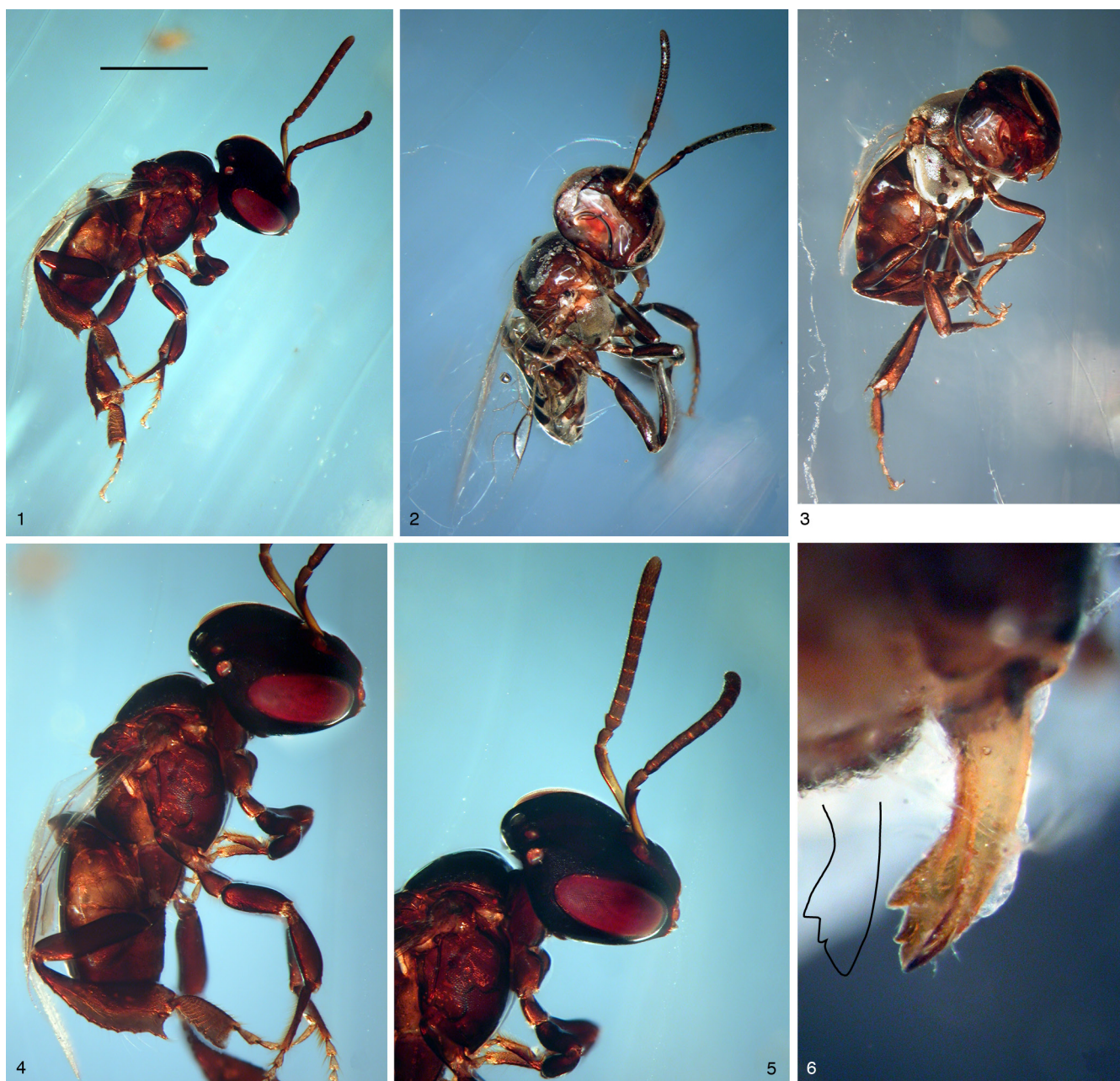
Figure 1. Trigonisca ameliae Penney n. sp. in Quaternary copal from Colombia: 1, holotype (NHM II 3059 [1]), scale bar = 1.0 mm; 2, paratype 1 (NHM II 3059 [2]) showing wing venation; 3, paratype 2 (NHM II 3059 [3]); 4, close-up of holotype; 5, close-up of holotype showing lack of setae on head and antennae; 6, paratype 3 showing left mandible dissected from the head after extraction of the inclusion using chloroform (with trace outline of T. moratoi mandible for comparison) (new).

Included species. — Trigonisca browni (Camargo & Pedro, 2005), T. chachapoya (Camargo & Pedro, 2005), T. clavicornis (Camargo & Pedro, 2005), T. longitarsis (Ducke, 1916), T. martinezi (Brèthes, 1920), T. mendersoni (Camargo & Pedro, 2005), T. moratoi (Camargo & Pedro, 2005), T. rondoni (Camargo & Pedro, 2005), T. schulthessi (Friese, 1900), T. tavaresi (Camargo & Pedro, 2005).