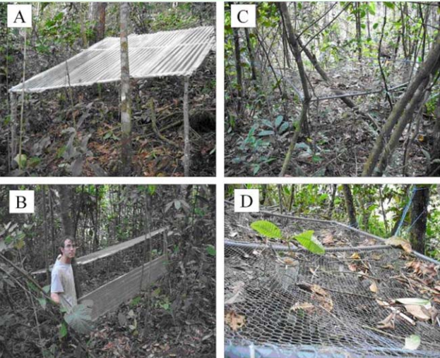
Figure 2. Rainfall-excluded (A, B) and rainfall-allowed (C, D) plots. High quality figures are available online.

www.romus.org ), volume, and weight of the sifted leaf litter were measured and its fauna was extracted with a mini-Winkler apparatus (Fisher 1996, 1998). All the extractions operated in the same room. After a 48-hour extraction, the collecting container was replaced by a new one and a second extraction was performed over a 48-hour period. No additional search for remaining ants was made