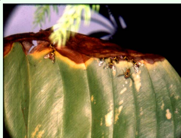
Figure 2. Male fruit flies ( Bactrocera dorsalis and Bactrocera umbrosa ) feeding along yellow-brown border of an infected leaf of Proiphys amboinensis . High quality figures are available online.