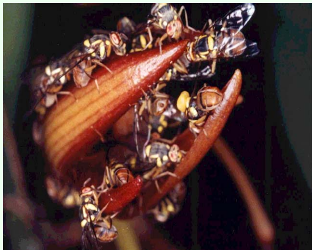
Figure 6. Male fruit flies, Bactrocera dorsalis , congregating and licking on a fully bloomed Bulbophyllum cheiri flower. High quality figures are available online.