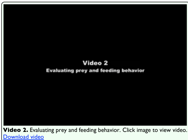
Video 2. Evaluating prey and feeding behavior. Click image to view video. Download video