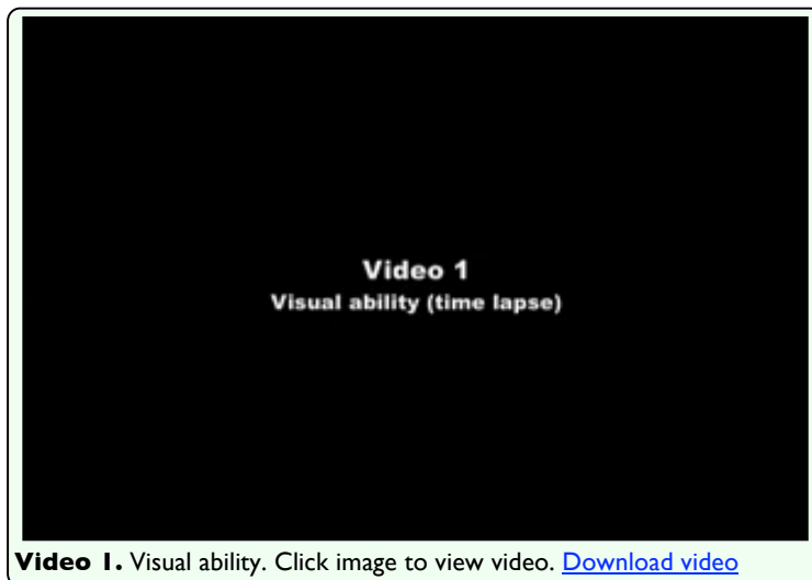
Video 1. Visual ability. Click image to view video. Download video

Zilahi-Balogh GMG, Salom SM, Kok LT. 2003c. Temperature-dependent development of the specialist predator Laricobius nigrinus (Coleoptera: Derodontidae). Environmental Entomology 32(6): 1322-1328.