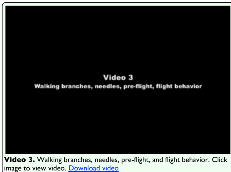
Video 3. Walking branches, needles, pre-flight, and flight behavior. Click image to view video. Download video