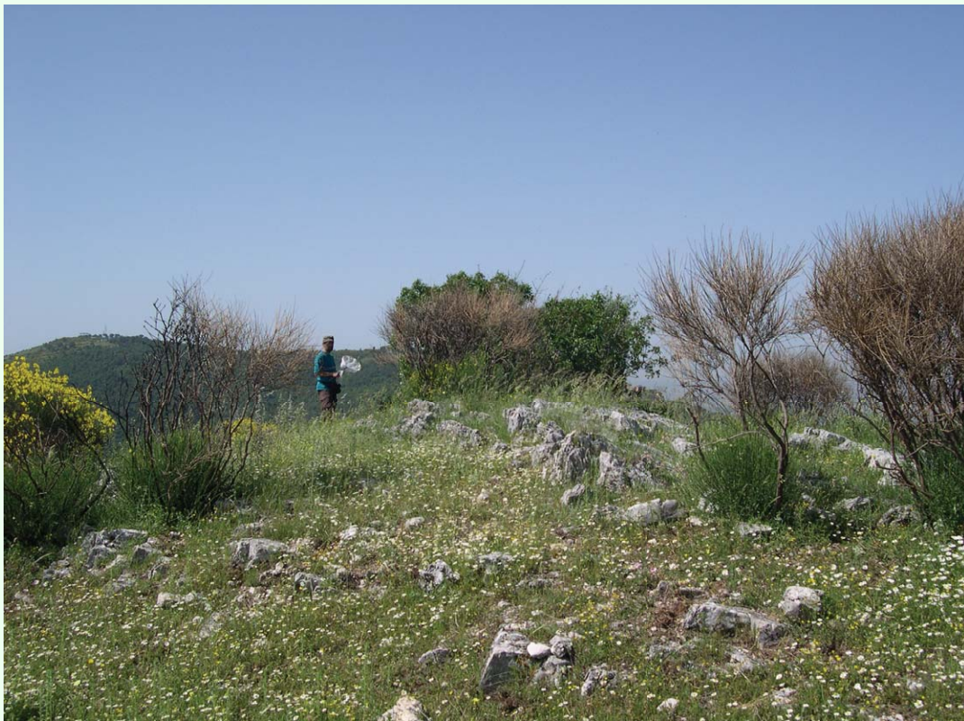
Figure 1. Colle Vescovo, (Latium, Italy, 41° 58' 39" N, 12° 48' 30" E), summit viewed from the northeast. Picture taken in late May 2008; the traces of a recent fire are still visible, and the 3 m Pistacia tree has been removed. High quality figures are available online.

None of the conopids observed on the hilltop were marked. Due to the relatively sporadic nature of their presence and to the sparse vegetation of the hilltop, however, it was often possible to record the activity of individuals without interruption for many minutes. Specimens were collected with a hand net and were deposited in the senior author's collection. Voucher specimens are in the Museum of