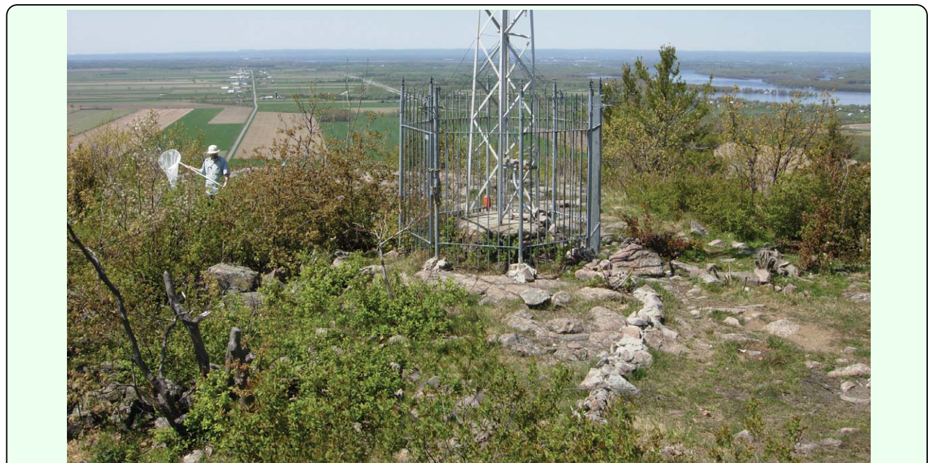
Figure 2. Summit of Mount Rigaud (Quebec, Canada 45° 27' 59" N, 74° 19' 35" W), looking toward the northwest. High quality figures are available online.

All data from Conopidae collected within 120 km of Ottawa, ON, Canada and represented in the Canadian National Collection of Insects, Arachnids and Nematodes are summarized. Ottawa was chosen as a focal point because three hilltops in the vicinity have received annual collecting attention since 1961. The hilltops involved are King Mountain, QC (49° 29' 20" N, 75° 51' 45" W), Duncan Lake vicinity, Masham, QC (45° 40' 53" N, 76° 3' 1" W) and Mount Rigaud, QC. The collections in the Museum of Zoology of the University of Rome “Sapienza” and in the Civic Museum of Zoology of Rome, were examined as well, to summarize data on any conopids collected within 1.5 km of the summit of Colle Vescovo.