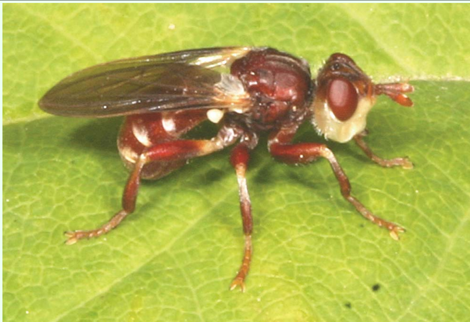
Figure 4. Myopa clausa : a hilltopping species of Conopidae found on Mount Rigaud, Quebec. High quality figures are available online.

Waiting D. aculeata males (Figure 5) were extremely alert, often adjusting their position on the perch or moving from one perch to another nearby at irregular intervals. It was possible to see their heads frequently tilting to follow the flight of insects, passing by within a distance of about 20-30 cm. Males alternated periods of perching with brief patrolling flights about the bush in which the perch was located, at a distance of a few centimeters from the bush itself. Some of these patrolling flights, however, were much longer with the insect leaving the bush to an unknown location. Sometimes such reconnaissance flights appeared spontaneous, but often they were triggered by the approach of a flying, similar-sized insect (e.g., tachinid fly or small bee). In such a case, the conopid would suddenly follow and closely inspect the insect, returning soon after to the bush.