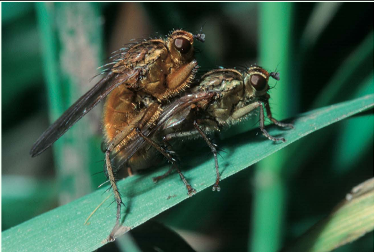
Figure 1 Copulating pair of S. Stercoraria . High quality figures are available online.

probably a closely related sister species, S. soror (Werner et al. 2006). It is not reported from anywhere else in the southern hemisphere. In North-Central Europe, S. stercoraria is one of the most abundant and widespread insect species associated with cow dung, although some similar scathophagid species may co-occur on cattle pastures, depending on location, but usually at much lower densities (e.g. S. furcata in North America and S. inquinata , S. suilla , and S. lutaria in Europe). The species' distribution pattern is likely influenced by human agricultural practices. While S. stercoraria is considered a cow-dung specialist, it can successfully breed on dung of other large mammals such as sheep (Hirschberger and Degro 1996), horse, deer, or wild boar (Blanckenhorn et al., unpublished data).