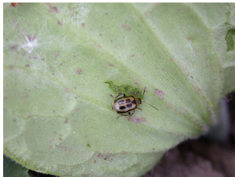
Figure 2. Photograph of an adult Cerotoma trifurcata on a pumpkin ('Magic Lantern') cotyledon with associated damage. Image was taken in a commercial pumpkin field near Rosemount, MN, 13 June 2003.