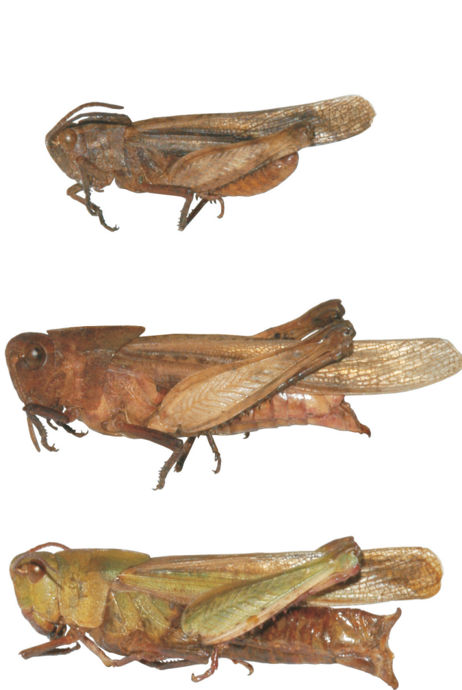
Fig. 1. Specimens representing typical C. viridifasciata (male = 1 st specimen, females 2 nd and 3 rd ). Note the lack of markings on the tegmina and hind femur, as well as the brownish to blackish hind tibiae. These specimens were collected in Lancaster County, Nebraska in April 2006. See Plate VII for color version.