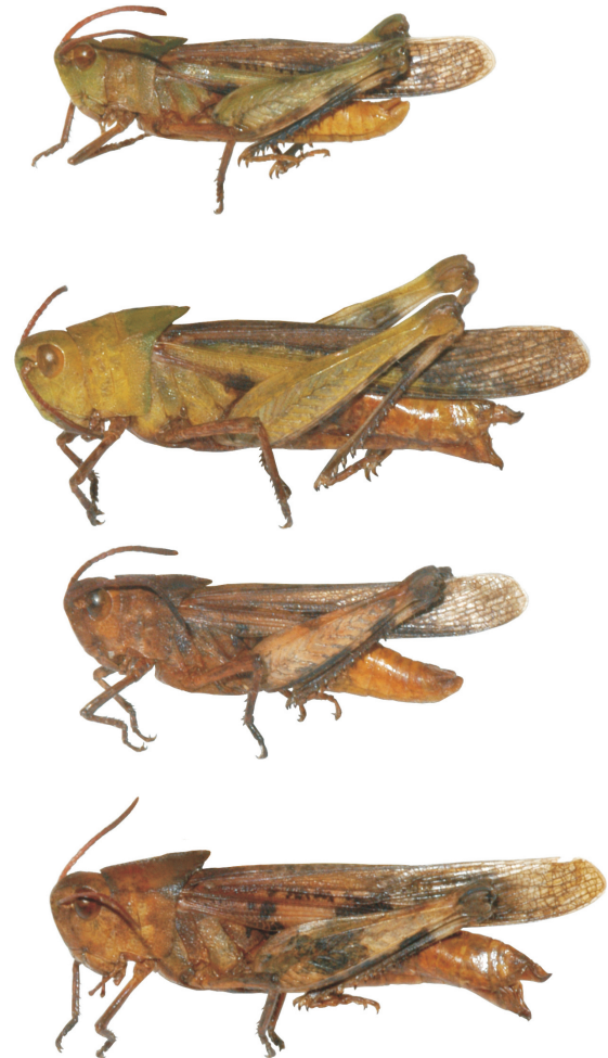
Fig. 2. Nebraska specimens sharing some characters with C. australior . Note the markings on the tegmina (all) and hind femur (top male; males = 1 st and 3 rd specimens, female = 2 nd and 4 th ), as well as the blue hind tibiae. These specimens were collected in Lancaster and Pawnee Counties in Nebraska in July 2006. See Plate VII for color version.