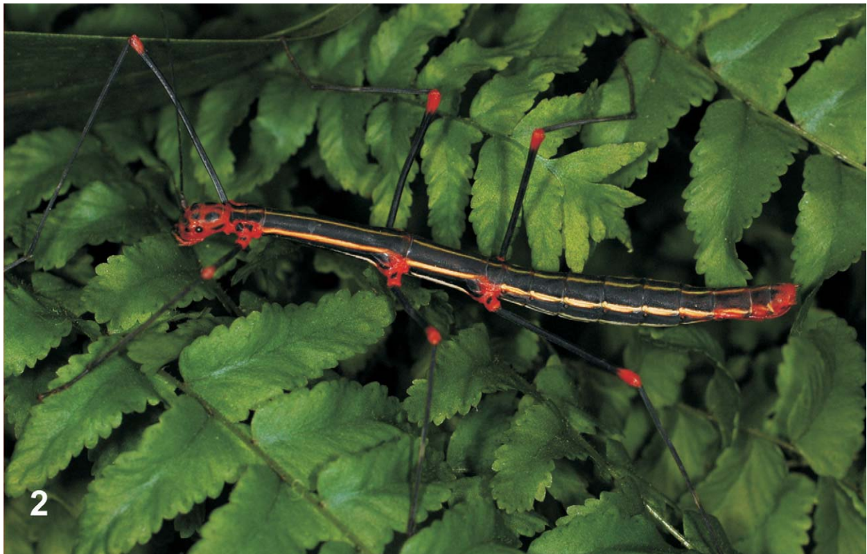
Fig. 2. Oreophoetes peruana peruana (Saussure, 1868), ♀, captive reared (orange variety). See Plates.