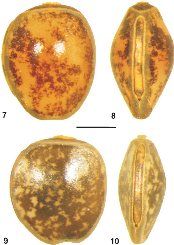
Figs 7-10. Eggs of Oreophoetes spp. [scale = 1mm]. 7. O. peruana peruana (Saussure, 1868), lateral view; 8. O. peruana peruana (Saussure, 1868), dorsal view; 9. O. topoense n. sp., lateral view; 10. O. topoense n. sp., dorsal view. See Plates.

Cerci yellow to pale greenish with the apical portion black. Legs mostly black with knees bright yellow to pale greenish. Femora each with one distinct creamish-white transverse band postmedially; tibiae with two creamish white transverse annulations in median portion. Tarsi black with ventral surface dark brown.