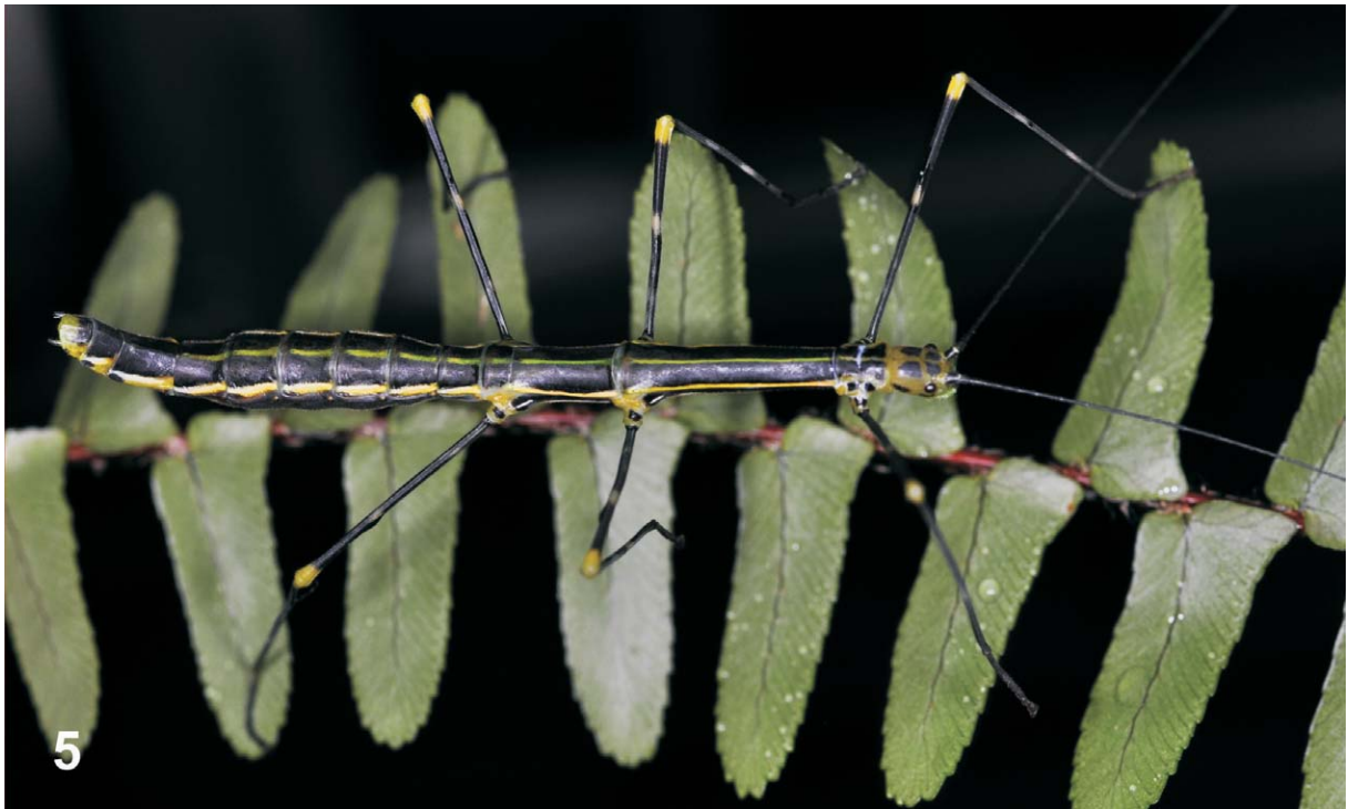
Fig. 5. Oreophoetes topoense n. sp. ♀ PT (in OC). See Plates.