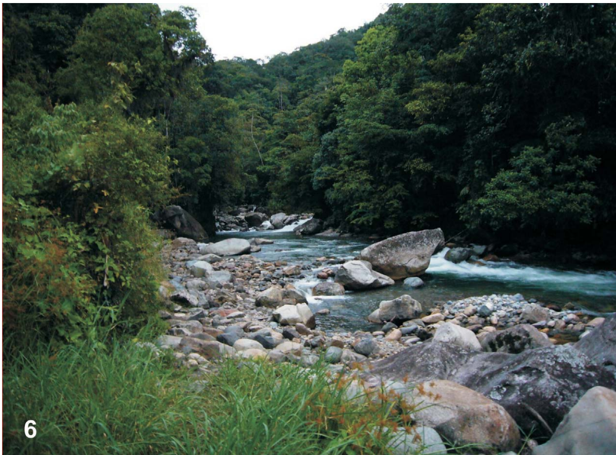
Fig. 6. Type locality of O. topoense n. sp., near the Rio Topo (Tungurahua Province, Ecuador) at 1600 m. See Plates.