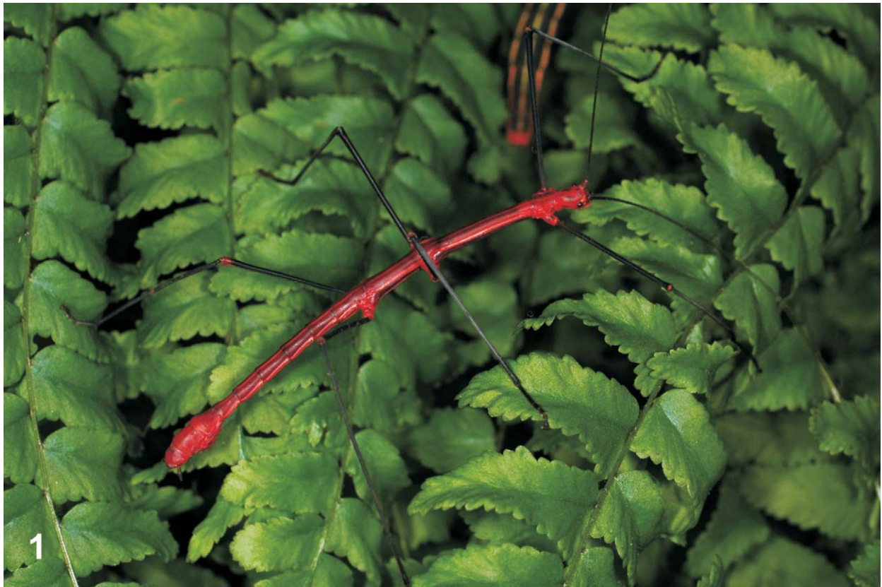
Fig. 1. Oreophoetes peruana peruana (Saussure, 1868), ♂, captive reared. See Plates.