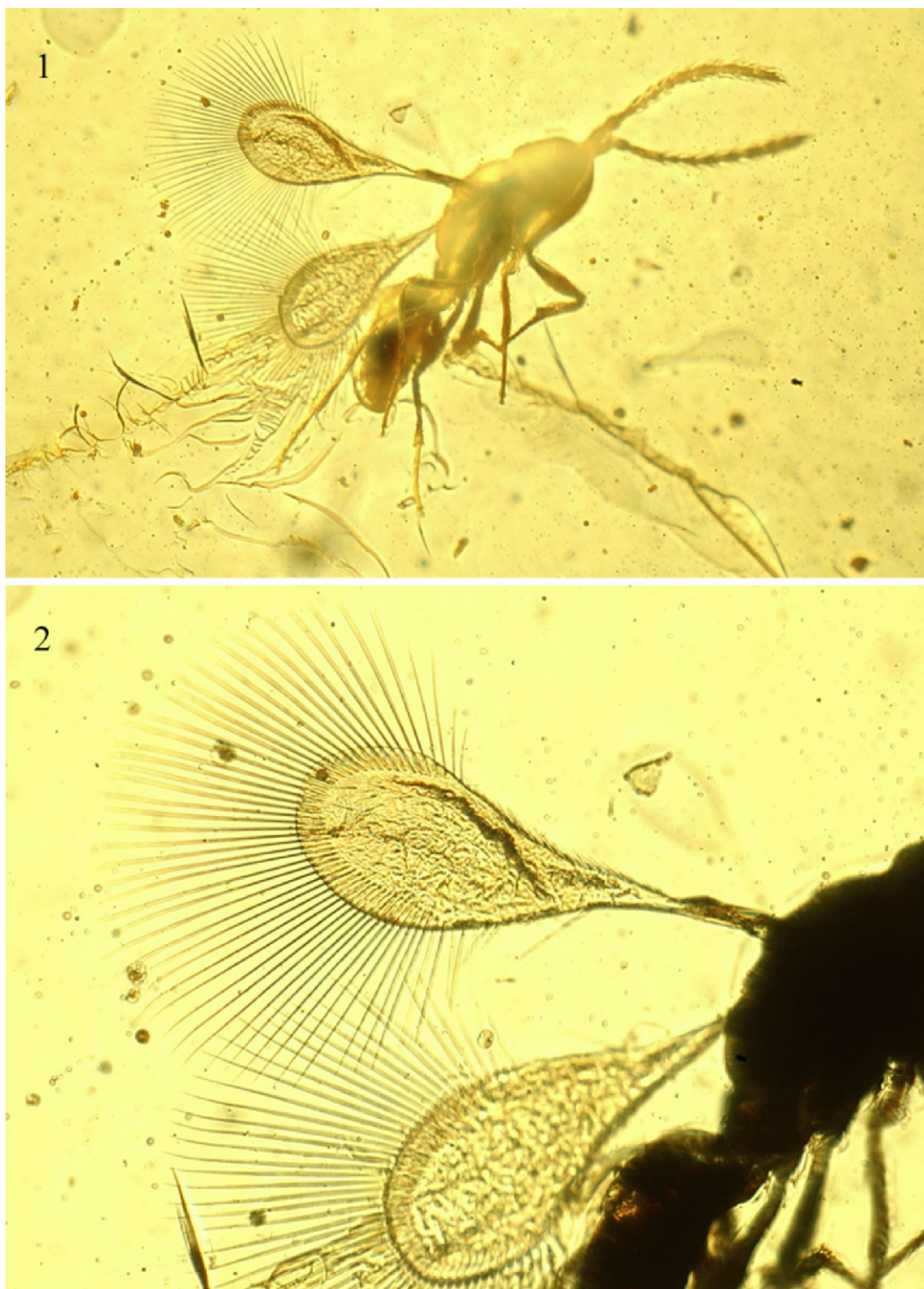
Figures 1–2. Holotype male of Archaeromma carnifex Engel and Grimaldi, new species (AMNH NJ-179), in Late Cretaceous (Turonian) amber from New Jersey. 1. Lateral aspect (total length of specimen 0.64 mm). 2. Detail of forewings (length of forewing 0.50 mm).