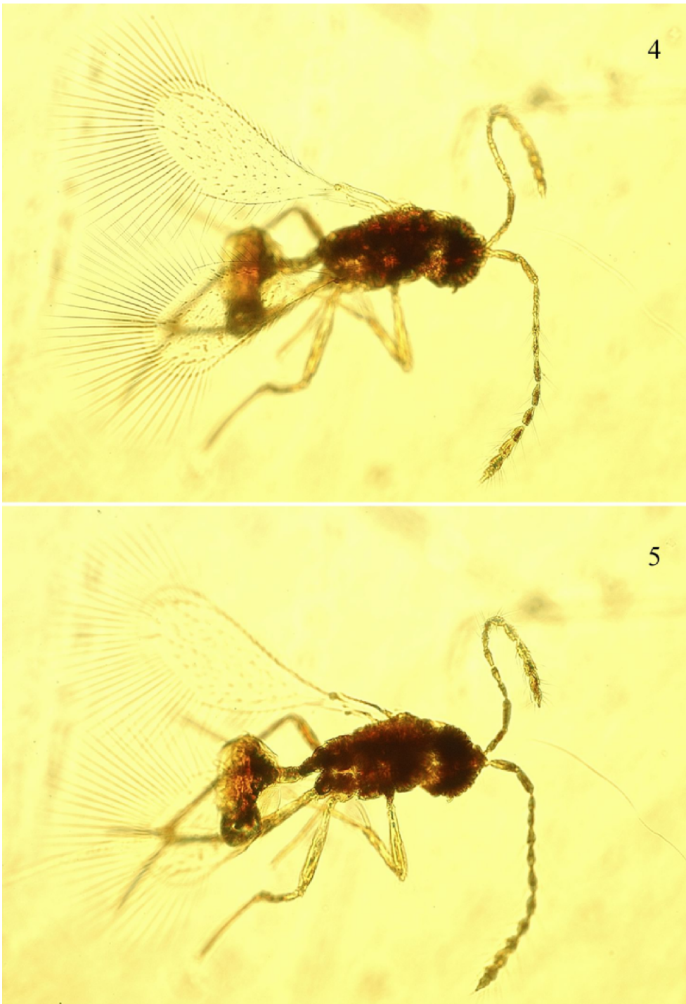
Figures 4–5. Holotype male of Archaeromma gibsoni Engel and Grimaldi, new species (AMNH Bu-997), in Cretaceous amber from Myanmar. 4. Image in focal plane of wings. 5. Image in focal plane of body. Total length of specimen 0.44 mm, forewing length 0.40 mm.