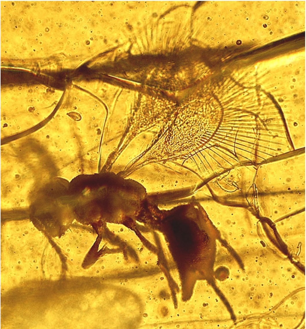
Figure 3. Lateral aspect of paratype male of Archaeromma carnifex Engel and Grimaldi, new species (AMNH NJ-1005), in Late Cretaceous (Turonian) amber from New Jersey (total length of specimen 0.51 mm).

disc membrane with distinct mesh-like rugosity or reticulations (Fig. 2), with a few scattered, short setae; distinct, elongate, suberect, posterobasal marginal seta (Fig. 2) offset by series of seven distinctly short and suberect setae from apical marginal fringe of elongate, erect setae; 55 erect marginal setae present (52 of these distinctly elongate) (Fig. 2).