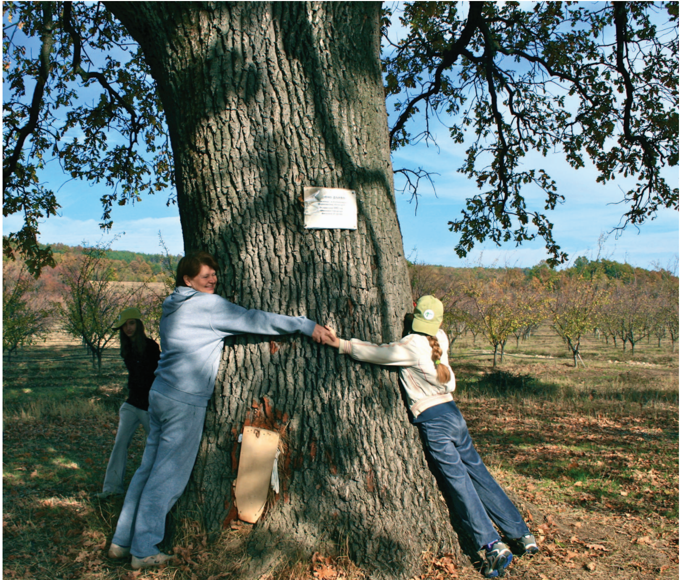
FIGURE 2 Big Foot participants discovering their local natural and cultural heritage near Berkovitsa, Bulgaria.

work affects protected areas, thus helping to decrease conflicts between conservation and land use. For example, training farmers could help prevent harmful grazing practices or the disappearance of traditional livestock breeds. IP can support this process. An example is the Farmers Education project in Greece, which used IP to train farmers to adopt new approaches to production and product promotion (document 4).