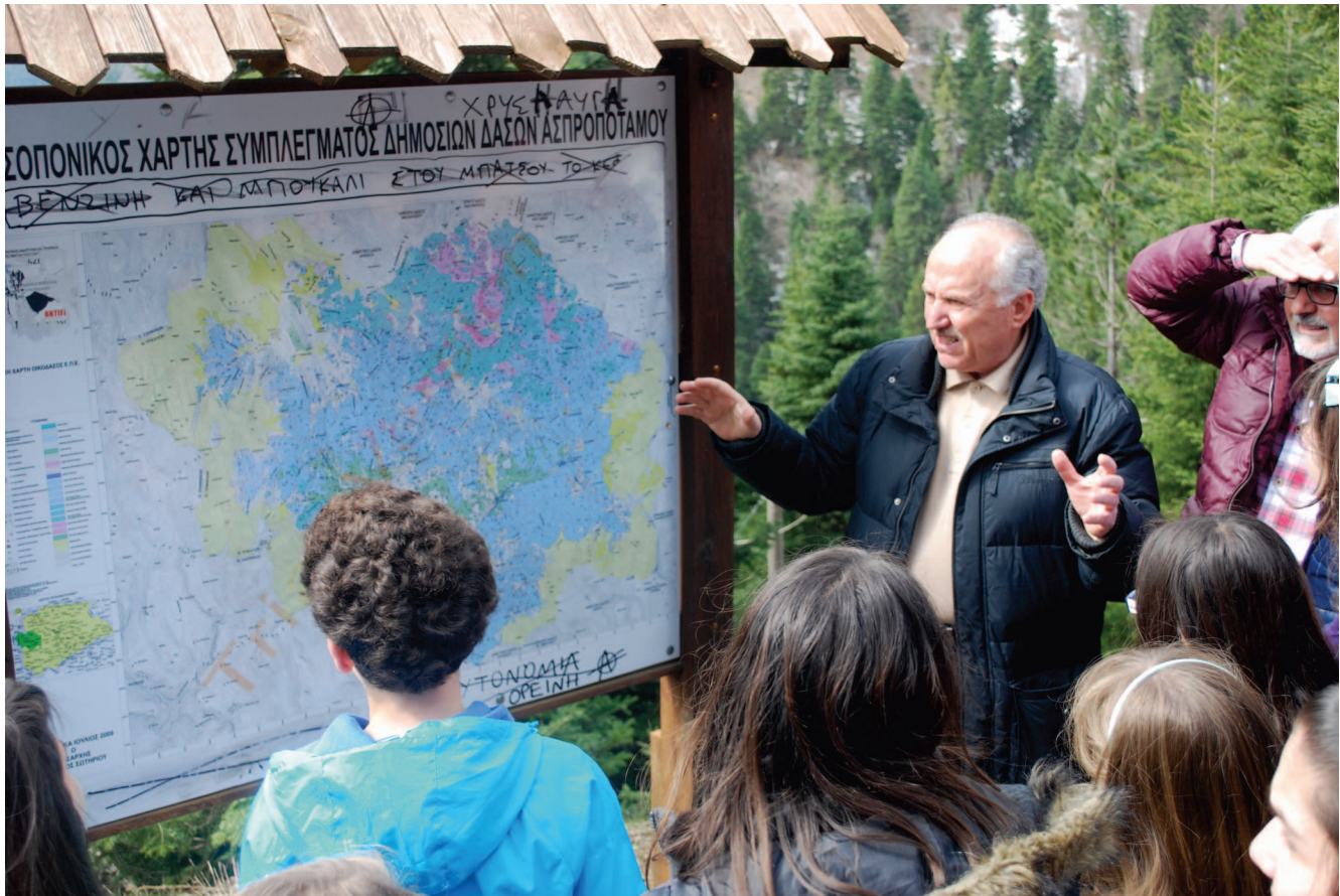
FIGURE 3 A retired protected area manager in Greece leads a Big Foot school nature excursion.

of youth in community development through an annual Youth with Impact Day, during which young people and adults plan projects (such as youth events and sports and entertainment facilities) and implement them together. Strategies Towards Active Citizenship involved various IPs promoting active citizenship among seniors in Europe, including senior education in various fields, storytelling for children, use of computers, and volunteering (document 1).