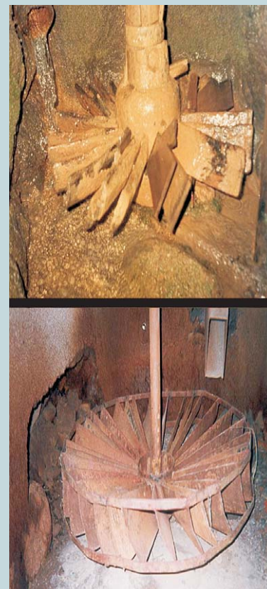
FIGURE 2 Traditional wooden water wheel (top) and upgraded steel wheel (bottom).

A ball bearing instead of an axle increased efficiency by 70%, while innovations in the blades brought an increase of 120%. Altogether, these measures have increased the power and efficiency of the traditional single mode system to a significant degree, by 80–90%. Such changes have inspired improvements in numerous watermills across the Indian mountain region to generate power commercially and put it into grids (Figure 3).