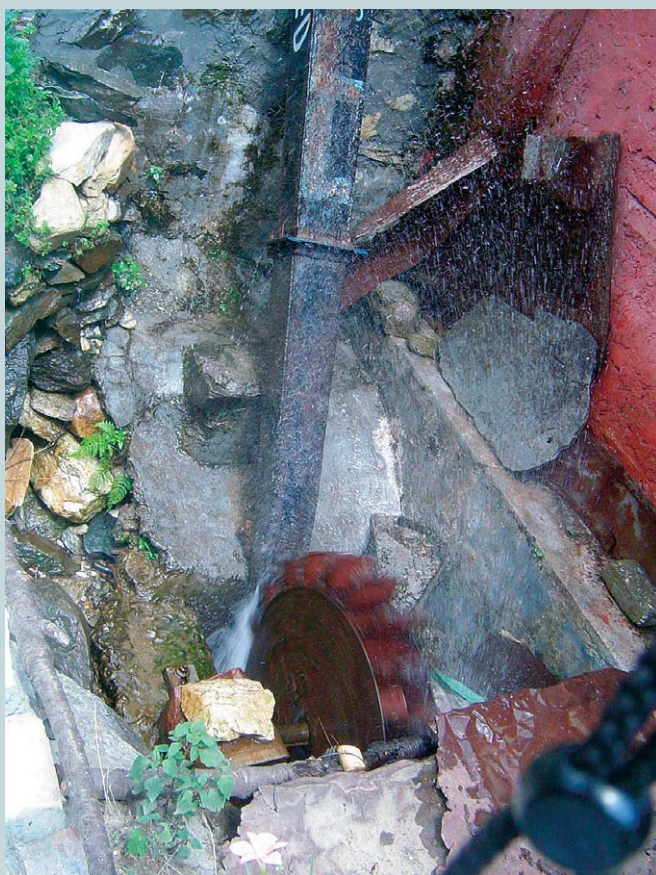
FIGURE 3 New steel runner and covered flume leading to much higher efficiency in using water power.