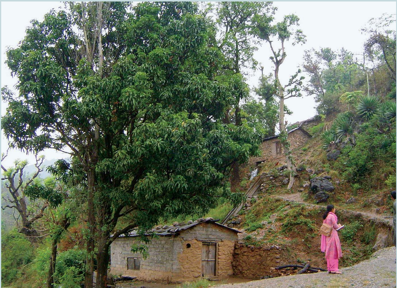
FIGURE 1 View of a traditional in-house watermill structure with water channel.

lence and the traditional wisdom of the people inhabiting the mountain region. In India, experts estimate that the watermill originated somewhere in the north-eastern region around the 7th century AD. The system worked harmoniously with nature for over 2700 years and is abundantly scattered across the