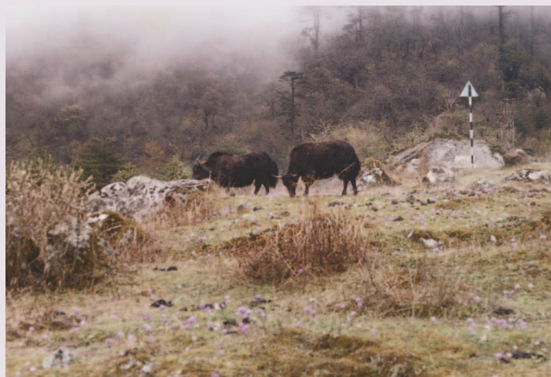
FIGURE 3 Yaks grazing on the alpine pastures in the buffer zones of the KBR.

tions under which annual income per household ranged from US$685 to US$1657 and literacy from 30% to 98%, with predominantly school-level education. The practice of livestock rearing to supplement agriculture and generate direct income is quite prevalent. Open grazing (eg, yaks grazing on alpine pastures, see Figure 3) is practiced for the most part, with limited stall feeding. The use of NTFPs and medicinal herbs is a common form of supplementary income.