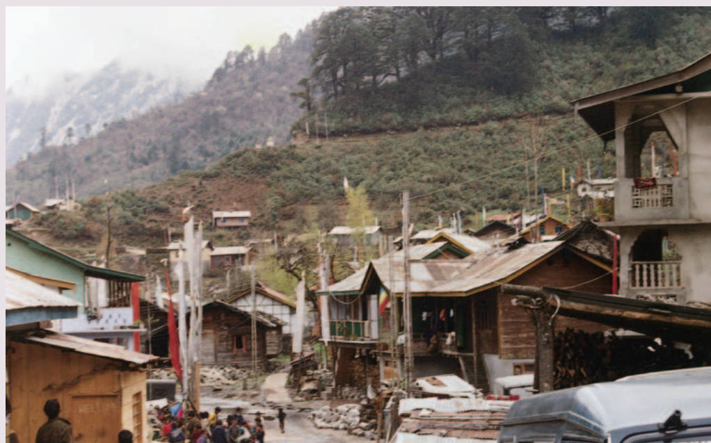
FIGURE 4 A high-altitude permanent fringe area settlement near the KBR.

Hence, conflicts are likely to crop up only when the real pressure of conservation restrictions begins to affect socioeconomic conditions and the traditional practices of people living in fringe area settle-