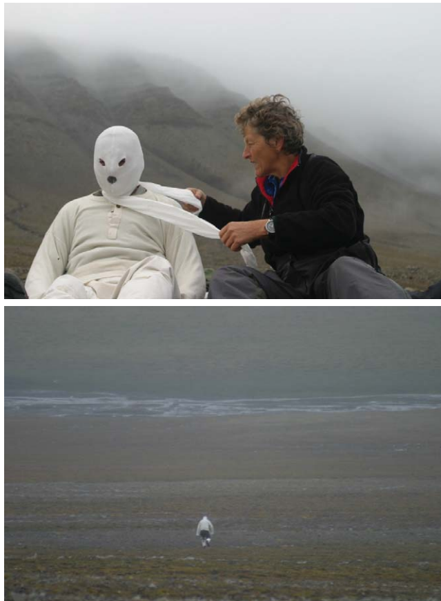
FIGURE 2. Lead author disguised as a polar bear approaching a group of Svalbard reindeer. Limited supplies of white clothing left the back of the observer uncovered.

displacement distance by the reindeer after taking flight. All response distances were measured with laser monoculars (Leica Rangemaster 1200 Scan; 1 m accuracy at 1000–1200 m).