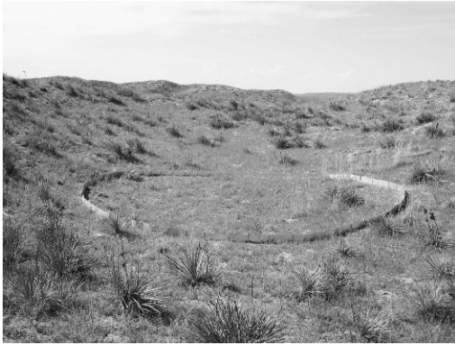
FIG. 2.—Placement of the west experimental arena (looking NNW) in a depression in the upland sandhills northwest of Gimlet Lake.

demographic studies of turtles (e.g., Converse et al., 2005; Iverson, 1991). Mud turtles to be displaced to arenas for our experiments were captured in the spring along the middle of these fences as they migrated directly to the wetland from their winter hibernation sites in the adjacent sandhills. When captured at the East Fence, turtles to be displaced had already traversed at least 60 m on their migration path to the lake (ca. SSW = 202.5°); those at the West Fence had moved at least 20 m (ca. ESE = 112.5°).