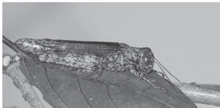
Image 3. Clonacris kirbyi Finot Lateral view