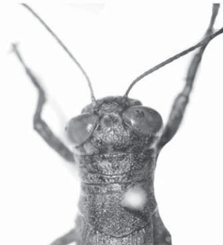
Image 4. Clonacris kirbyi Finot Dorsal view of head

Fig. 1. Clonacris kirbyi Finot collected at Patgaon, Taluka Chandgad, Dist., Kolhapur [N 16° 07' 40.66" E 73° 56' 04.15", 2098 ft (639.5 m) asl], northwestern Ghats, Maharashtra, India.