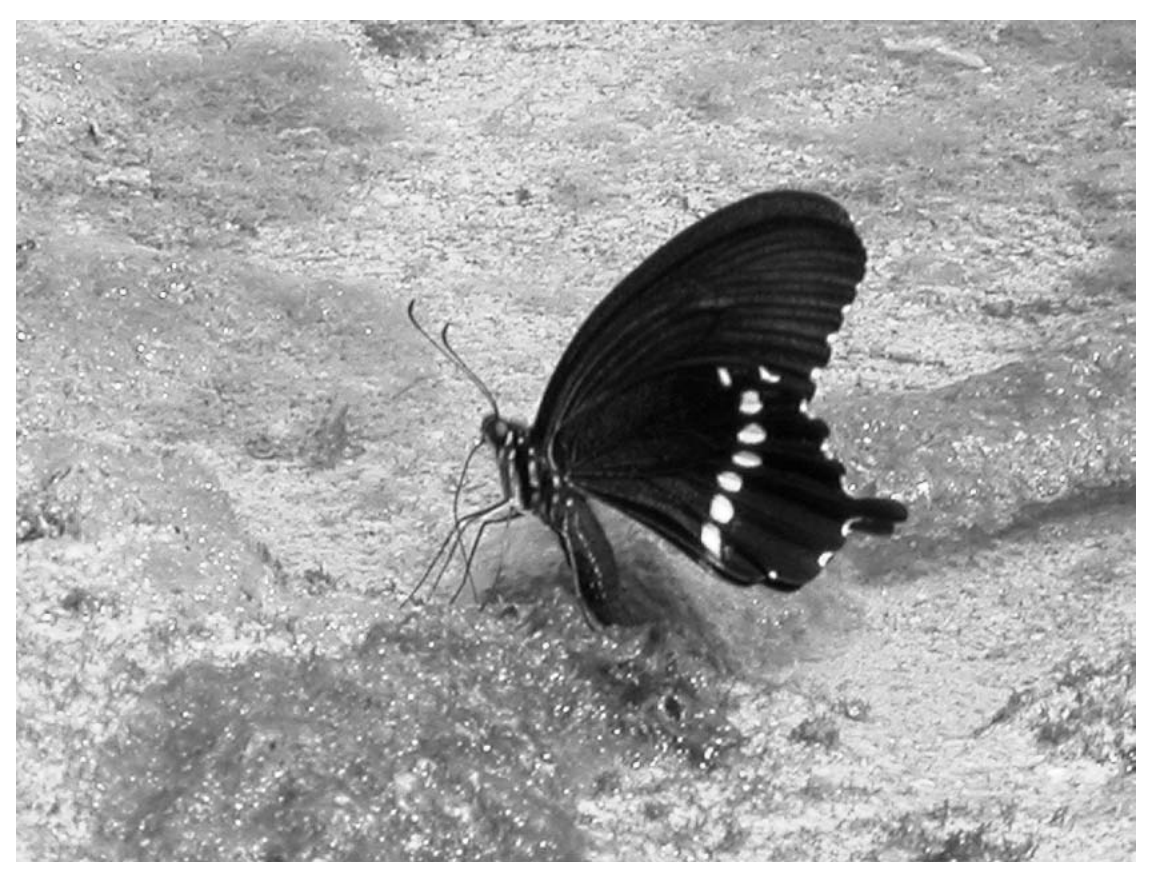
Fig. 2. Specimen of Papilio polytes drinking seawater on Ipan reef shelf (Guam). Note the proboscis introduced into the water.

On August 28, 2004, on a sunny afternoon, we observed about 20 male specimens of Papilio polytes Linnaeus, 1758, drinking seawater at low tide, on the Ipan reef shelf on the southeast coast of the island of Guam (Micronesia, USA) (Fig. 1). The butterflies were extending their proboscis directly into the sea while standing on green algae floating mats or on exposed coral structures (Fig. 2), at a distance from the shore ranging from 0.3 to 15 m. This behavior was observed for about 1 h until the butterflies left. No other Lepidoptera were seen on the reef, but numerous specimens of Euploea eunice Quoy, 1815, were observed on the beach shrubs.