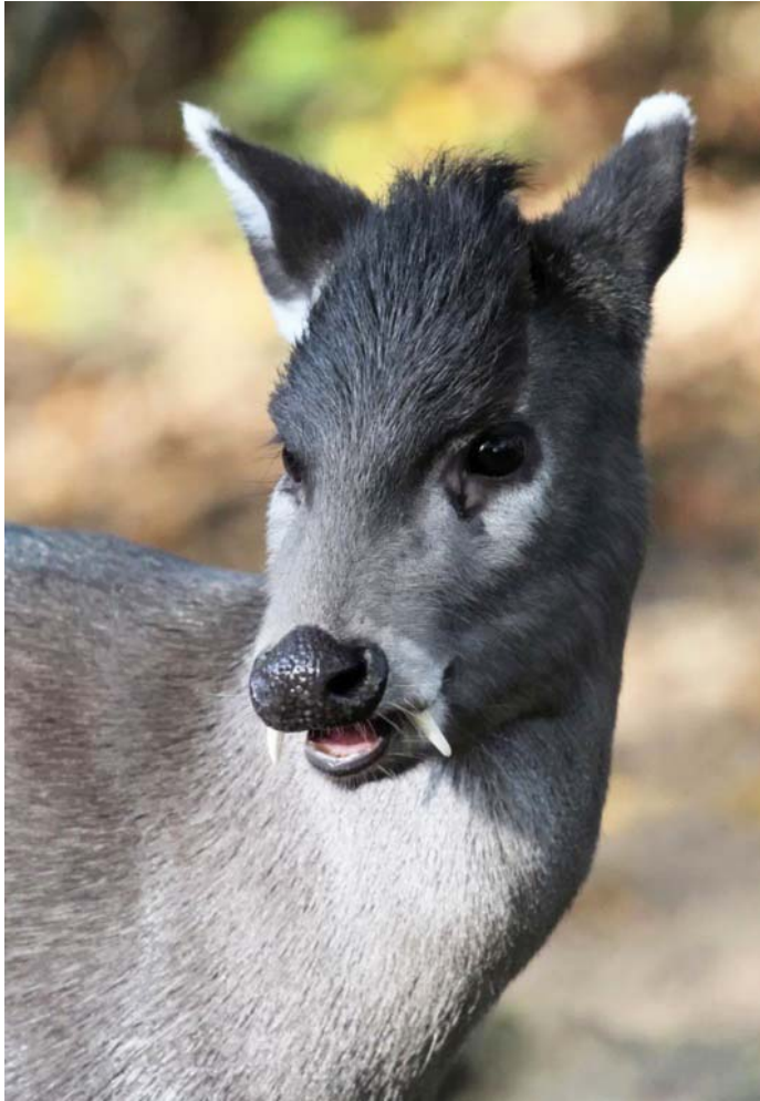
Fig. 6. —Developed upper canine teeth, tufts on hair on the top of the head, and white-tipped ears are characteristic of male (pictured here) and female Elaphodus cephalophus ; only males have antlers, but they are typically obscured by the crown tuft and perhaps rarely shed (unlike annually shedding of antlers by other species of Cervidae).

agile and flees with “catlike jumps,” with its tail upright and wagging, exposing the white underside (Geist 1998:47)