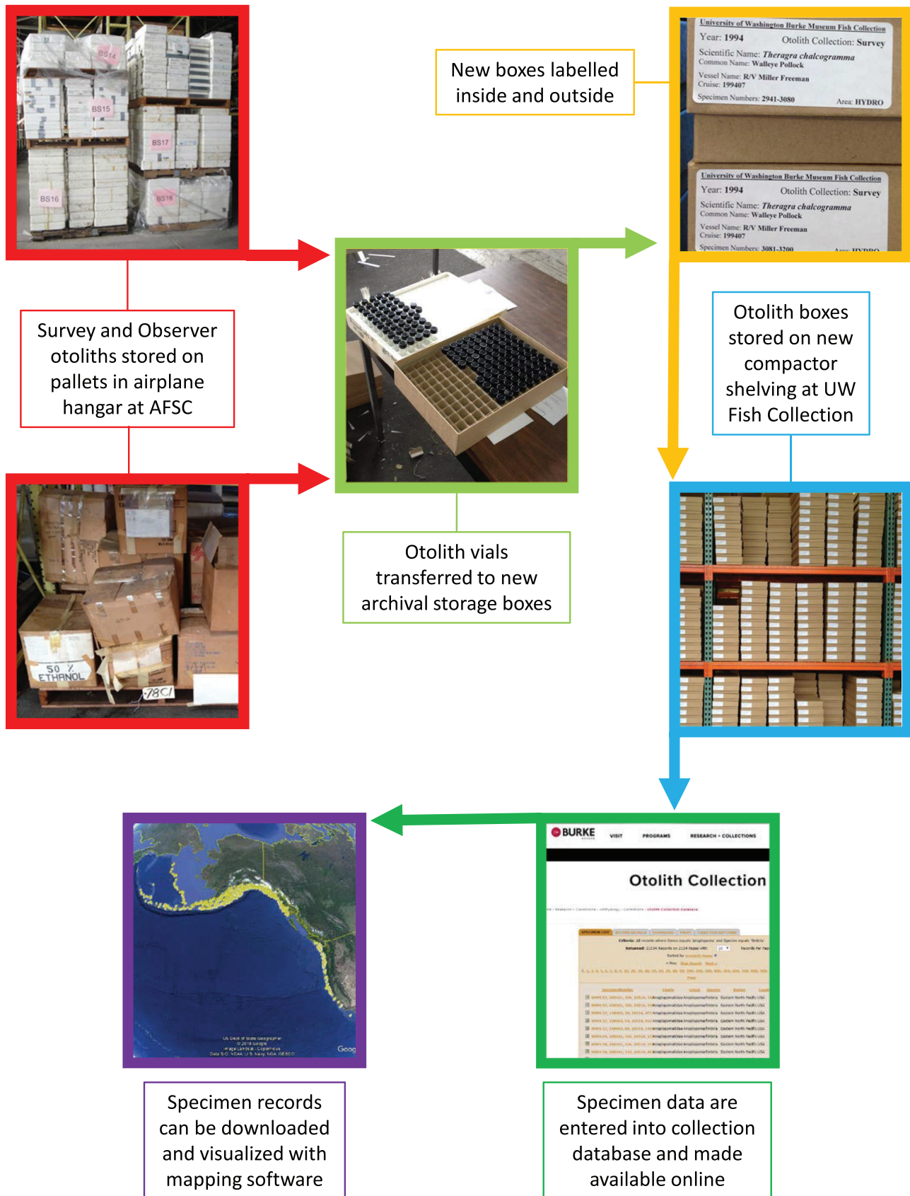
Fig. 3. Transfer of otoliths from the NOAA Fisheries AFSC to the UW Fish Collection. Survey-collected otoliths in Styrofoam boxes stacked 6 meters high (top left picture) and observer-collected otoliths in old cardboard boxes (center-left picture) stored in a World War II-era hangar at the AFSC. The otolith vials are transferred from Styrofoam boxes to new archival-quality cardboard boxes. Both boxes and lids are labeled to ensure no loss of data. Boxes are organized on new compactor shelves in a new storage facility at the UW. Specimen and locality data are entered in the collection database