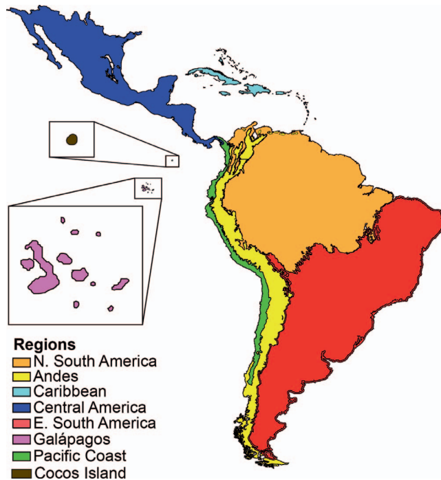
FIGURE 1. Map of biogeographic areas used in BioGeoBEARS eight-area regime. Five-area regime combined the four regions of South America mainland that are shown here.

likelihood analyses (>70 Bootstrap Support). This change in topology potentially alters the biogeographic interpretation of the origin of Darwin's finches. In addition, advances in biogeographic analyses in the last 15 yr indicate that a reassessment of the biogeography of the group is warranted. The R package BioGeoBEARS provides a framework for testing maximum likelihood and Bayesian models to reconstruct ancestral ranges (Matzke 2013a). The ability to customize models within this package allows new model types to be compared in addition to more widely used models. Therefore, we use the Burns et al. (2014) phylogeny and the more modern statistical approaches available through BioGeoBEARS to test a variety of biogeographical models. Using maximum likelihood, we estimate the ancestral ranges for all species in the subfamily Coerebinae and provide an update to the biogeographical analyses of Burns et al. (2002). Using this reconstruction, we evaluate the 2 proposed hypotheses for the origin of Darwin's finches in an attempt to provide consistency to the literature and to better understand the evolutionary context from which this radiation evolved.