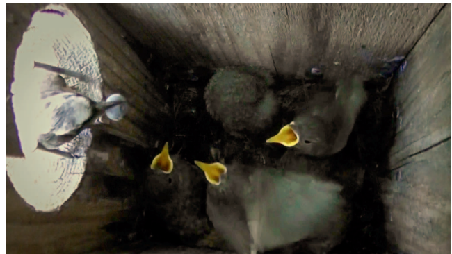
SUPPLEMENTAL MATERIAL VIDEO S4. Common Redstart male feeding his own nestling with a whortleberry. https://www.youtube.com/watch?v=-bxKLRz3gS8