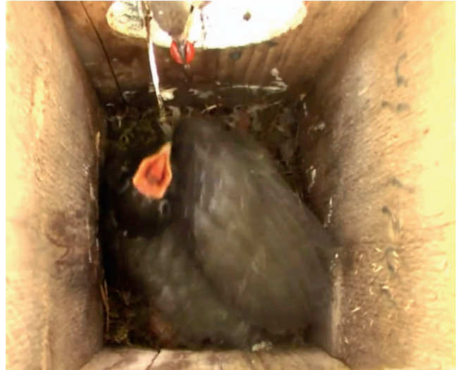
SUPPLEMENTAL MATERIAL VIDEO S3. Common Redstart female feeding a parasitic Common Cuckoo nestling with a lingonberry. https://www.youtube.com/watch?v=i0anKhxo5Ss

We defined fledging success as the proportion of hatchlings that fledged. For redstart broods, each nest represented 1 data point (i.e. the proportion of hatchlings that fledged from each nest). In mixed broods, we scored cuckoo and redstart nestlings separately. Shortly before expected fledging, nest boxes with cuckoos were checked daily and those with redstarts every 1–3 days. For fledging success analyses, the a priori temporal criterion for successful redstart fledging was that nestlings survived to 11 days of age (following Järvinen 1990). For cuckoos, the criterion was 18 days (Grim 2006c), with the day of hatching = day 0 (Li et al. 2016). We managed to follow all cuckoos and all but 1 redstart brood through to fledging; thus, we applied the temporal criterion to only 1 nest. Nests that failed due to predation ( n = 5 ) or inclement weather ( n = 1 ) were excluded in fledging age, mass, and success analyses because we wanted to test only for potential effects of diet type.