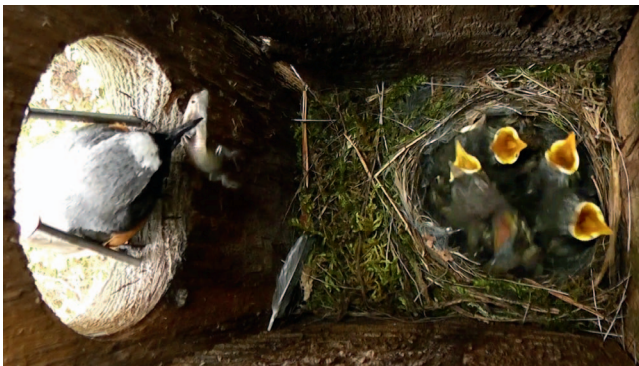
SUPPLEMENTAL MATERIAL VIDEO S2. Common Redstart male feeding his own nestling with a viviparous lizard. https://www.youtube.com/watch?v=eeBbii18itc

Using 2 types of cameras, we video-recorded nestling provisioning from hatching (day 0) to fledging. This whole period covered up to the age of 14 days in redstart nestlings and 20 days in cuckoo nestlings (Grim et al. 2009a, Grim and Samaš 2016). During each day of the nestling period, we video-recorded 15–39 nests with redstart nestlings and 13–37 nests with cuckoo nestlings. Due to this extensive sampling, we were able to identify unusually high (compared with typical dietary studies) numbers of prey items for both host (243–1,003 items per day) and parasitic nestlings (73–827 items per day). Nestlings older than the typical fledging age (i.e. >14 days for redstarts and >20 days for cuckoos) are naturally uncommon (due to fledging), but we managed to video-