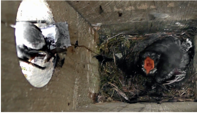
SUPPLEMENTAL MATERIAL VIDEO S1. Common Redstart male feeding a parasitic Common Cuckoo nestling with a viviparous lizard. https://www.youtube.com/watch?v=FLjuMDgwGg8

fledge when human nest checks may trigger premature fledging (see also Grim 2007b).