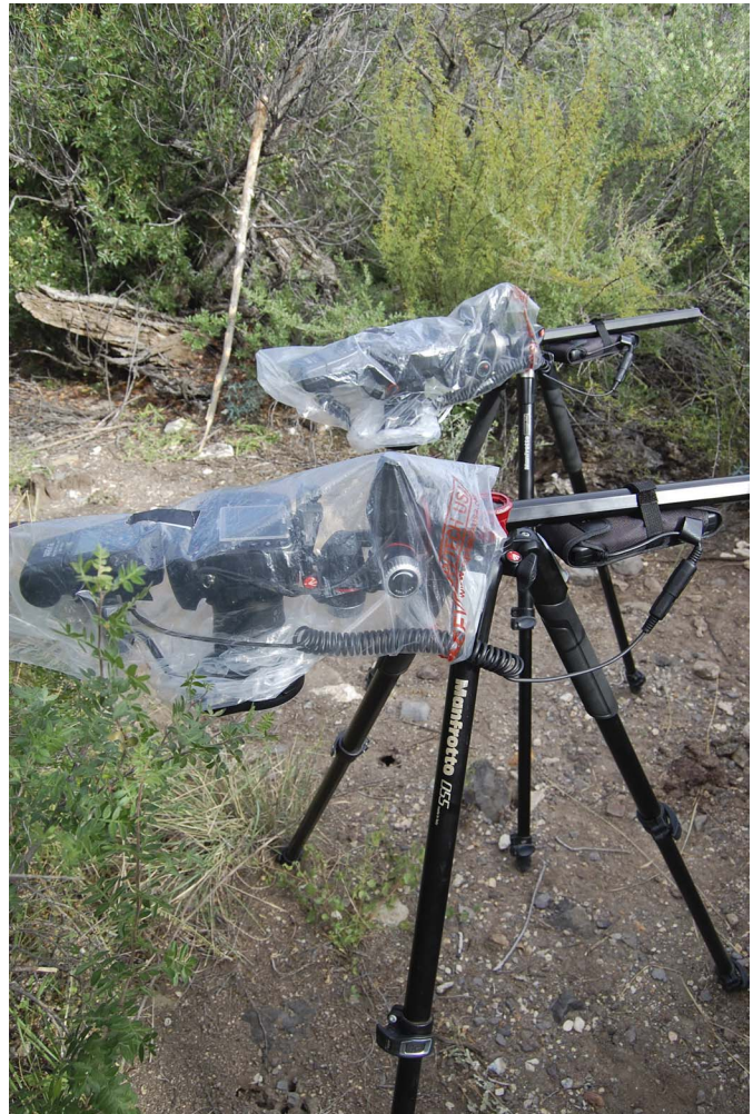
Figure 2.—Camera set-up over nests of Novomessor albisetosus ; field of view includes main nest entrances as well as an extensive area surrounding the nest entrance (approximately 0.152 m 2 covered by each camera).

The similarity in color, size, and eye reflectance of the spider photographed October 12 th and M. chihuahuensis (compare Fig. 3 with Fig. 4) is compelling. The adjacency of the photographed spider with ants, particularly dead ants, also strongly suggests this to be M. chihuahuensis . The fact that the spider never left the vicinity of the nest entrance; was not photographed away from the entrance, despite five nights of filming and nearly 4000 images surveyed; was