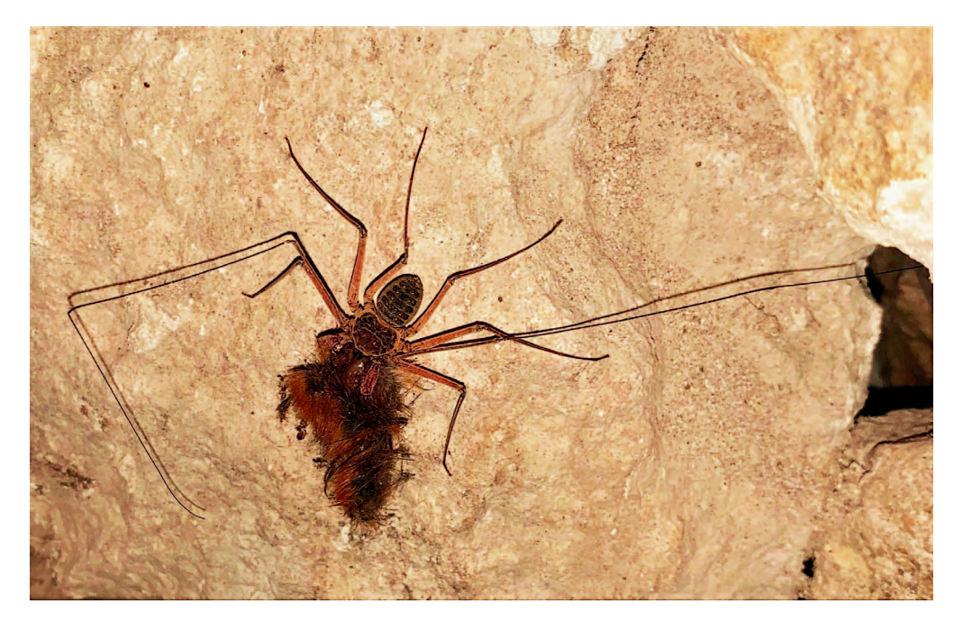
Figure 1.— Paraphrynus raptator feeding on Otonyctomys hatti remains. Low resolution (72 dpi) due to the opportunistic nature of the observation; shot with iPhone XR 4mm, 1/48s, f/1.8, ISO-25, handheld, auto-flash.

Paraphrynus raptator (Pocock, 1902). Paraphrynus raptator is a moderately large species (20–30 mm total length) distributed in the U.S. (Florida), Mexico, Guatemala (Petén), and Belize. This species is a troglophile, is synanthropic and is adapted to a wide variety of habitats, mainly in tropical humid to very humid forests, between 100 and 1500 m.a.s.l. (Armas 2006; Armas et al. 2018).