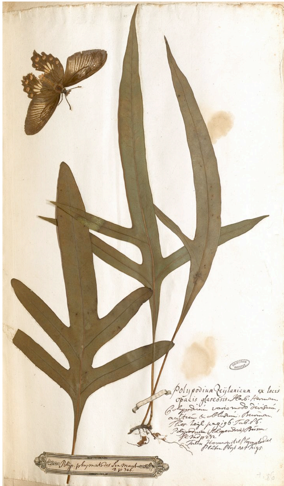
Fig. 6. – Page 41 of Paul Hermann's herbarium from Ceylon in BIF-CEYL with original material of Polypodium scolopendria Burm. f.