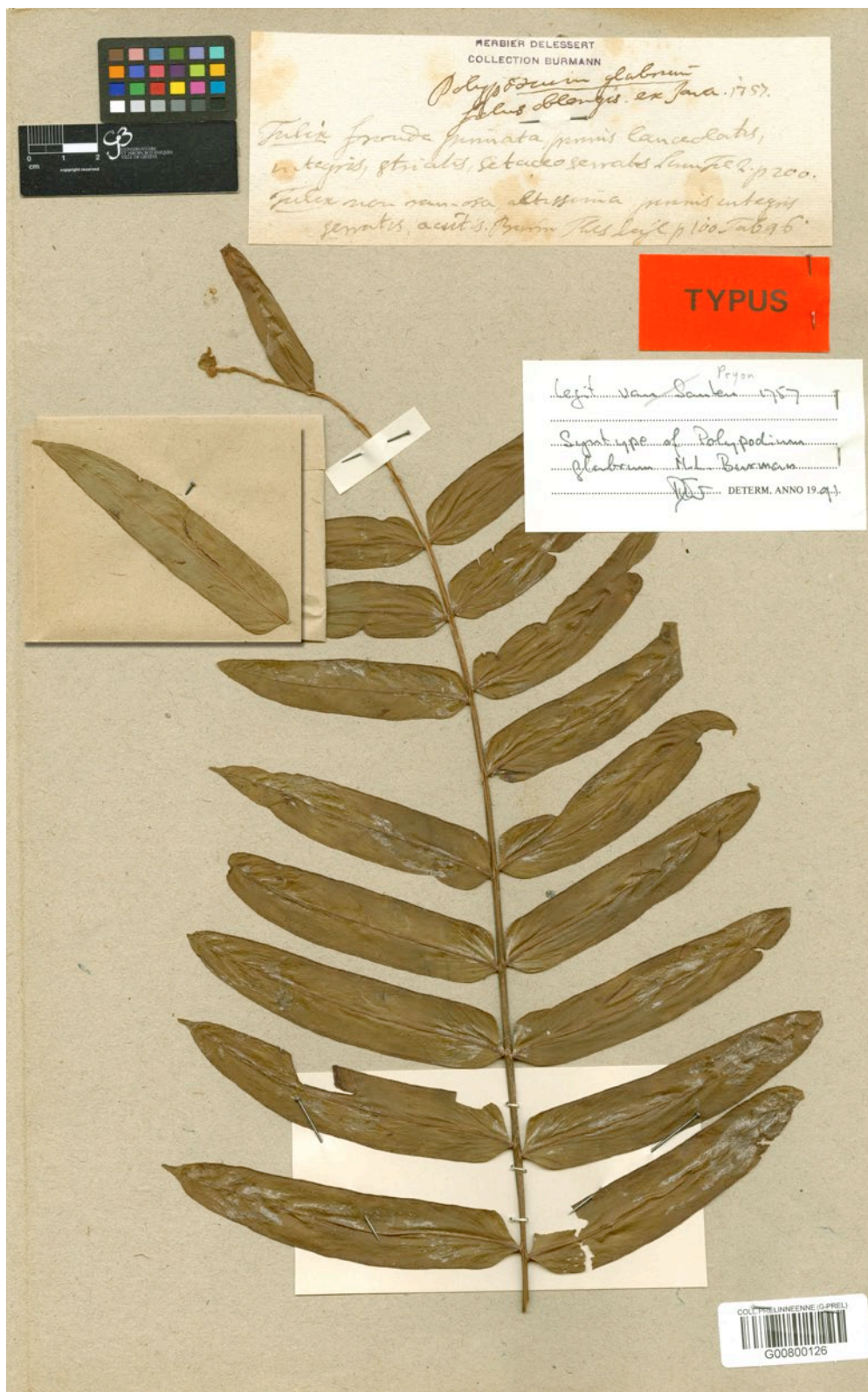
Fig. 5. – Lectotype of Polypodium glabrum Burm. f. in G-PREL.