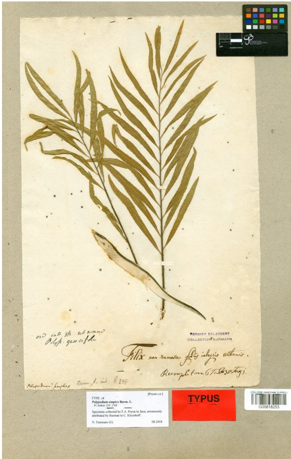
Fig. 7. – Lectotype of Polypodium simplex Burm. f. in G-PREL.